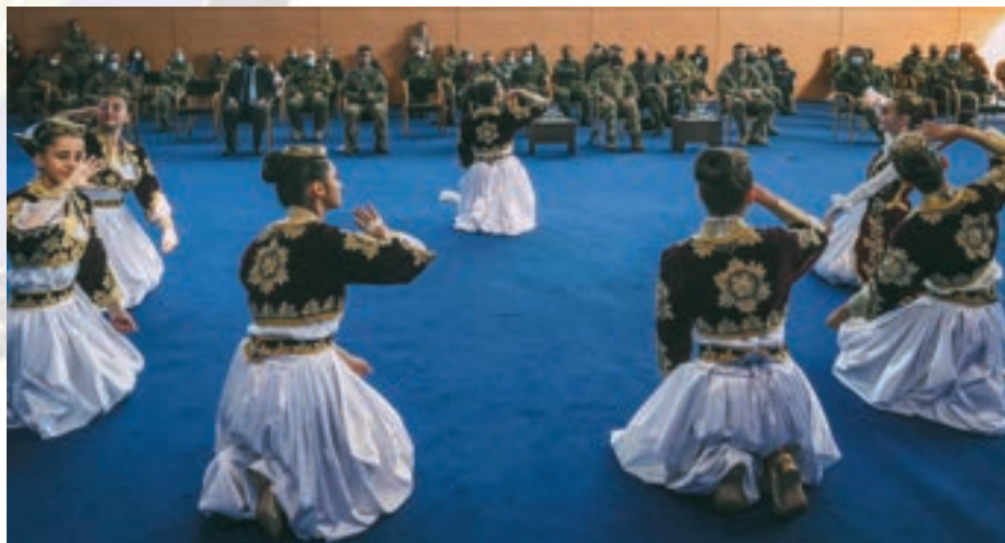
Turkish National Day in KFOR HQ