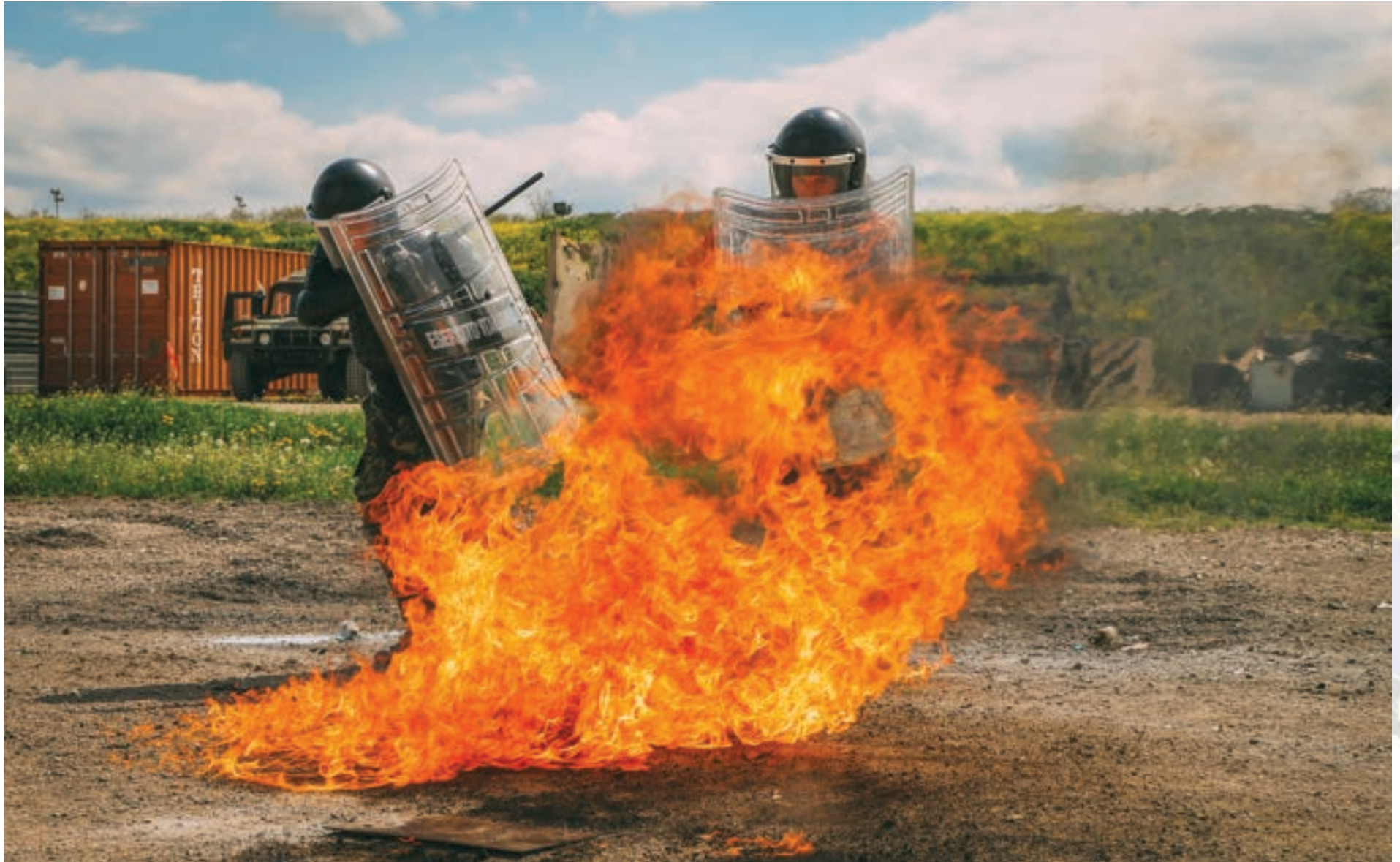
Soldiers conducting Fire Phobia Drills