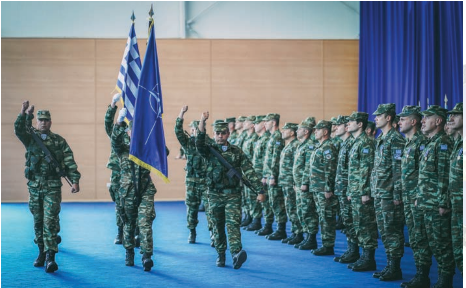
Greek Medal Parade in Camp Film City