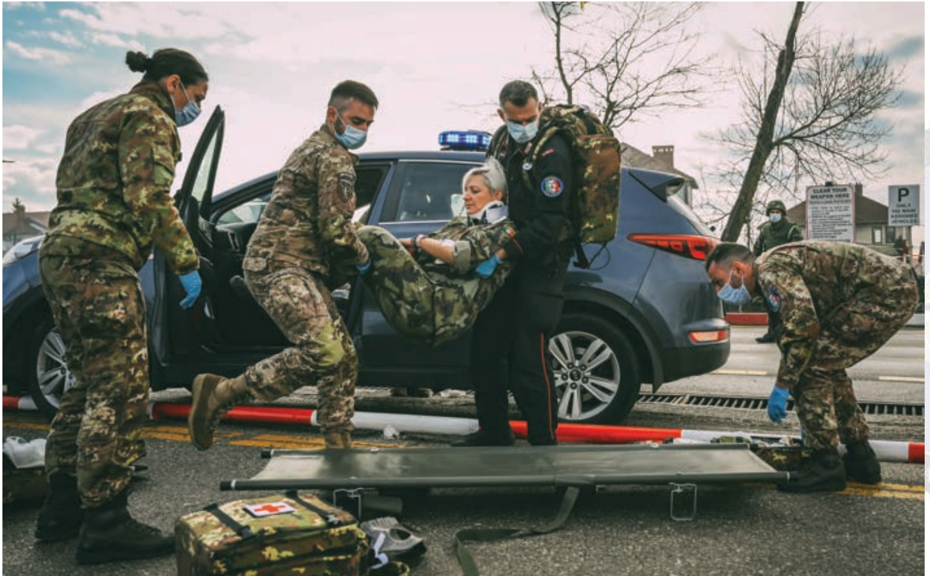
Italian Medics tend to an injured Soldier during MASCAL exercise in KFOR HQ