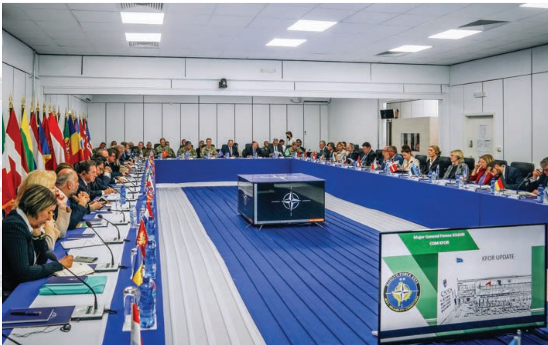
COM KFOR at NAC Conference