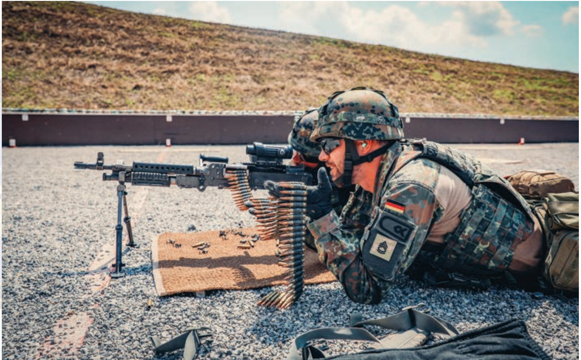
Soldiers from German contingent conduct range practices