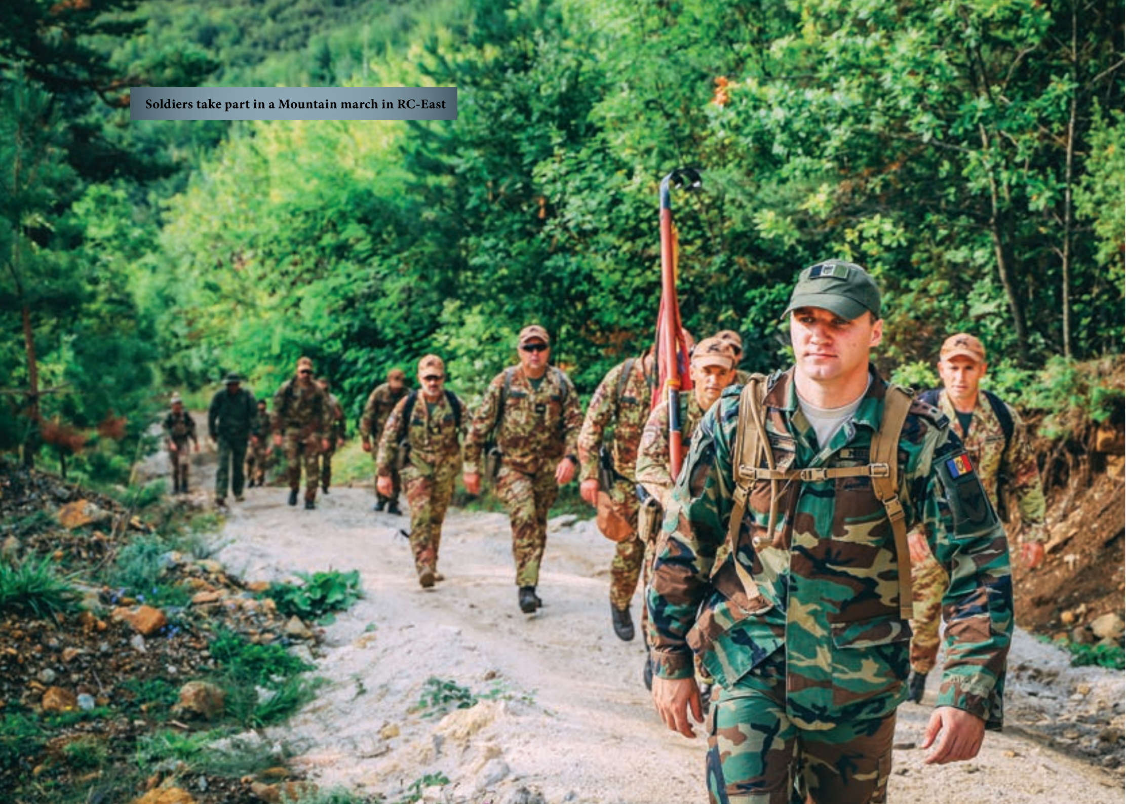
Soldiers take part in a Mountain march in RC-East