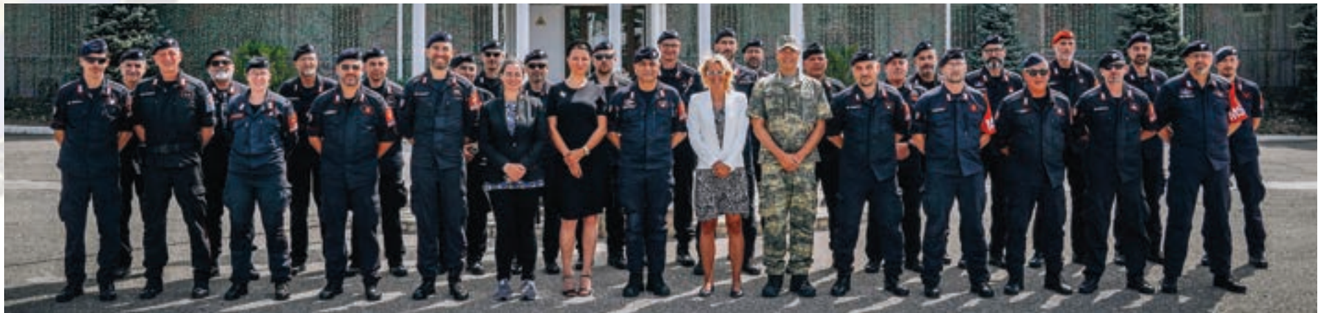
GENAD Conference held in MSU