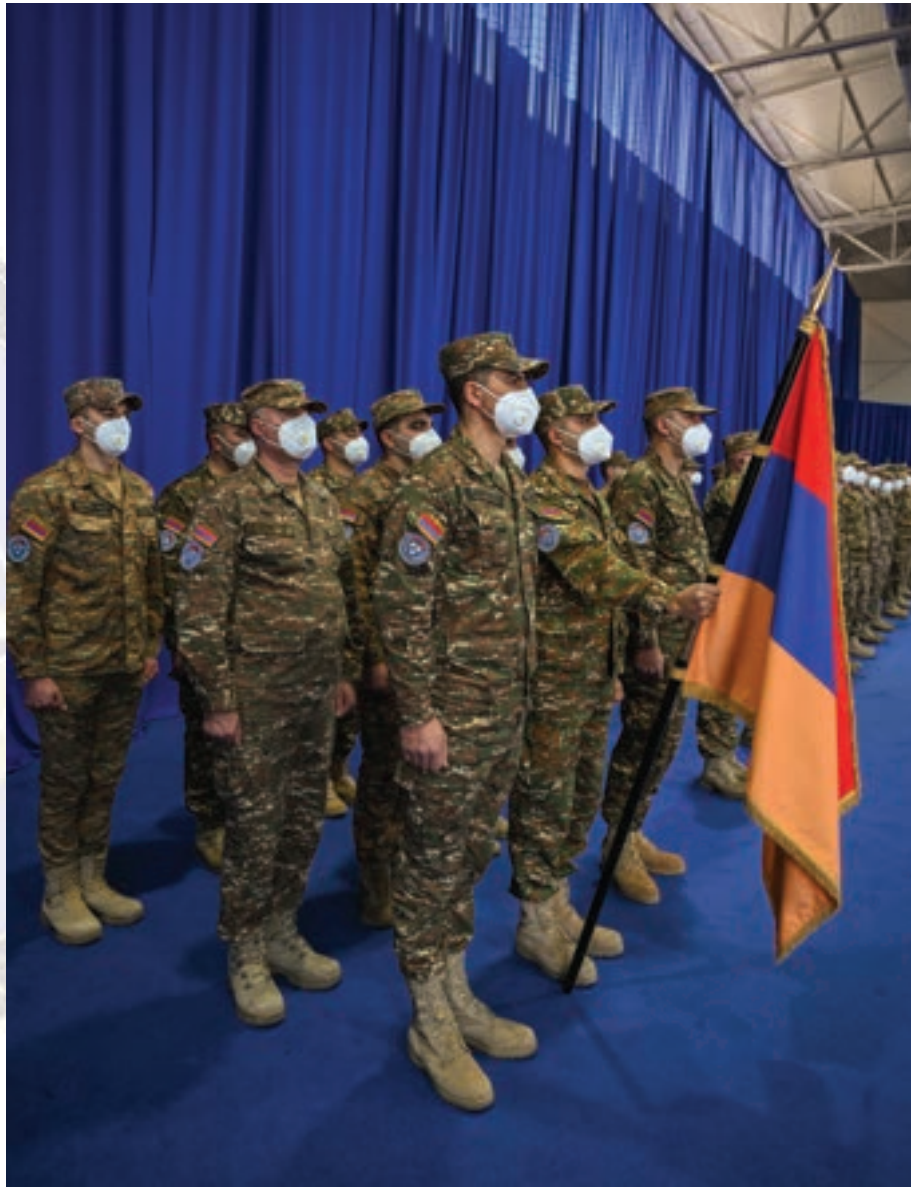
Armenian Medal Parade