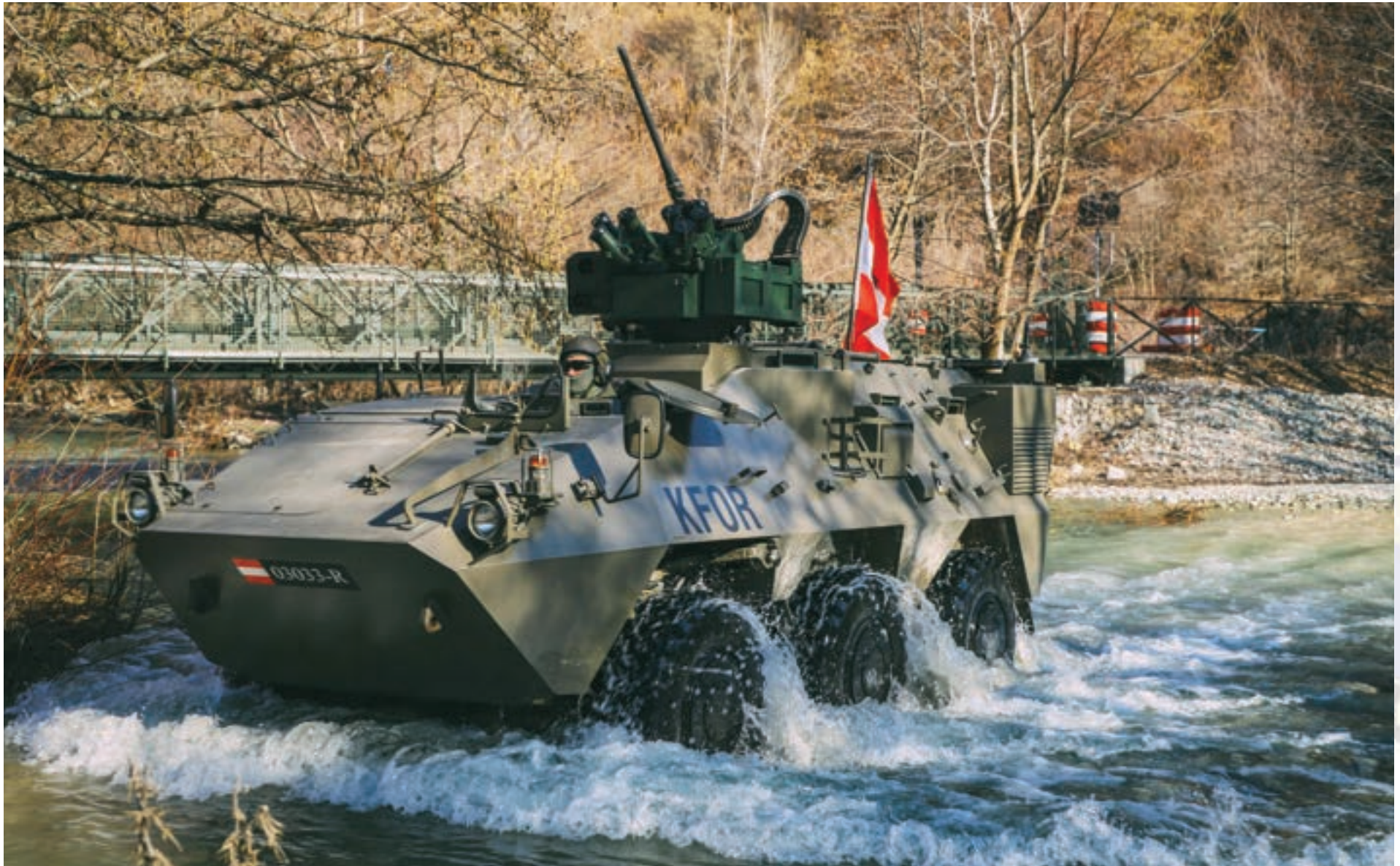
Austrian APC crossing a river