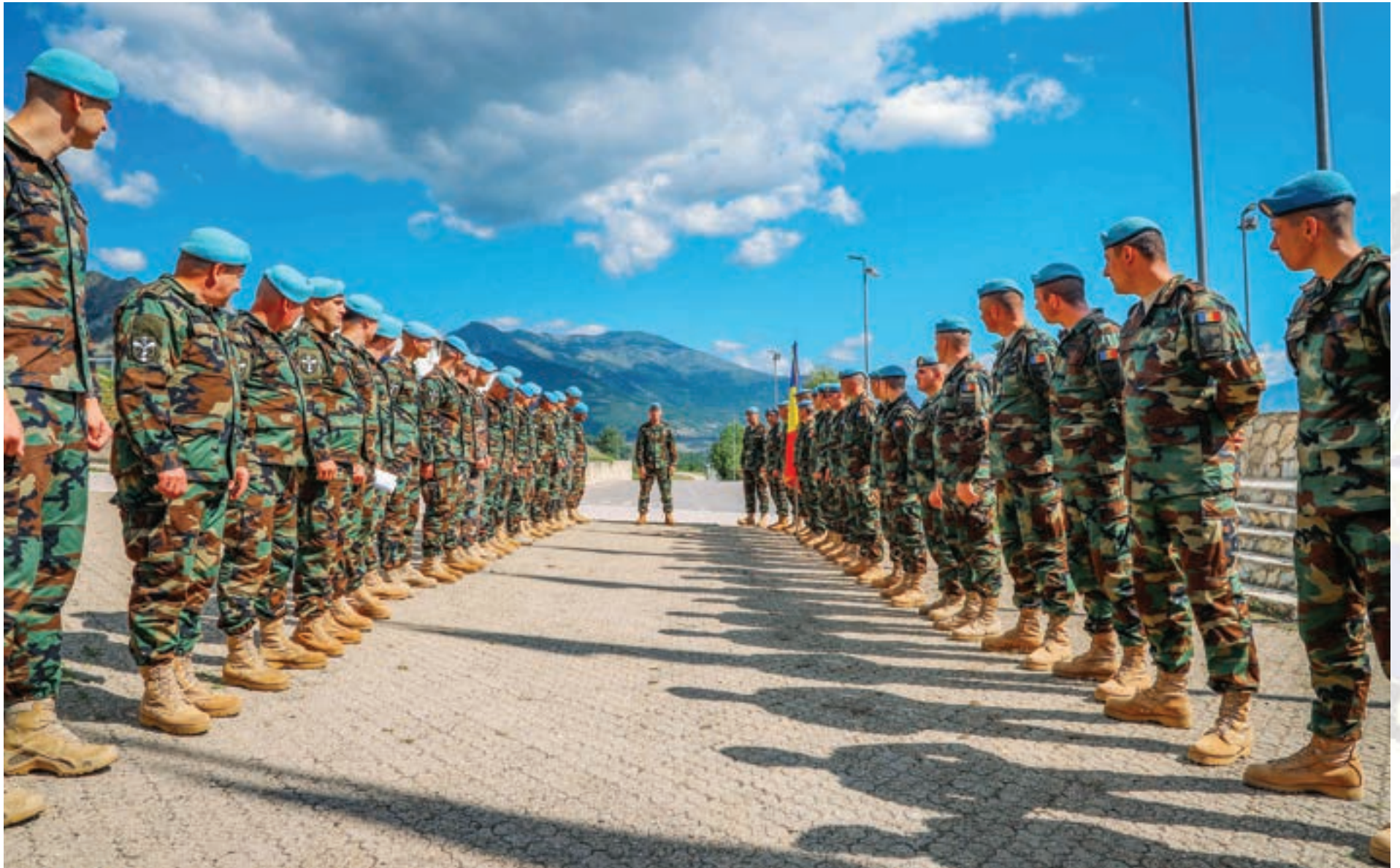
Moldovan soldiers in Camp Villaggio Italia