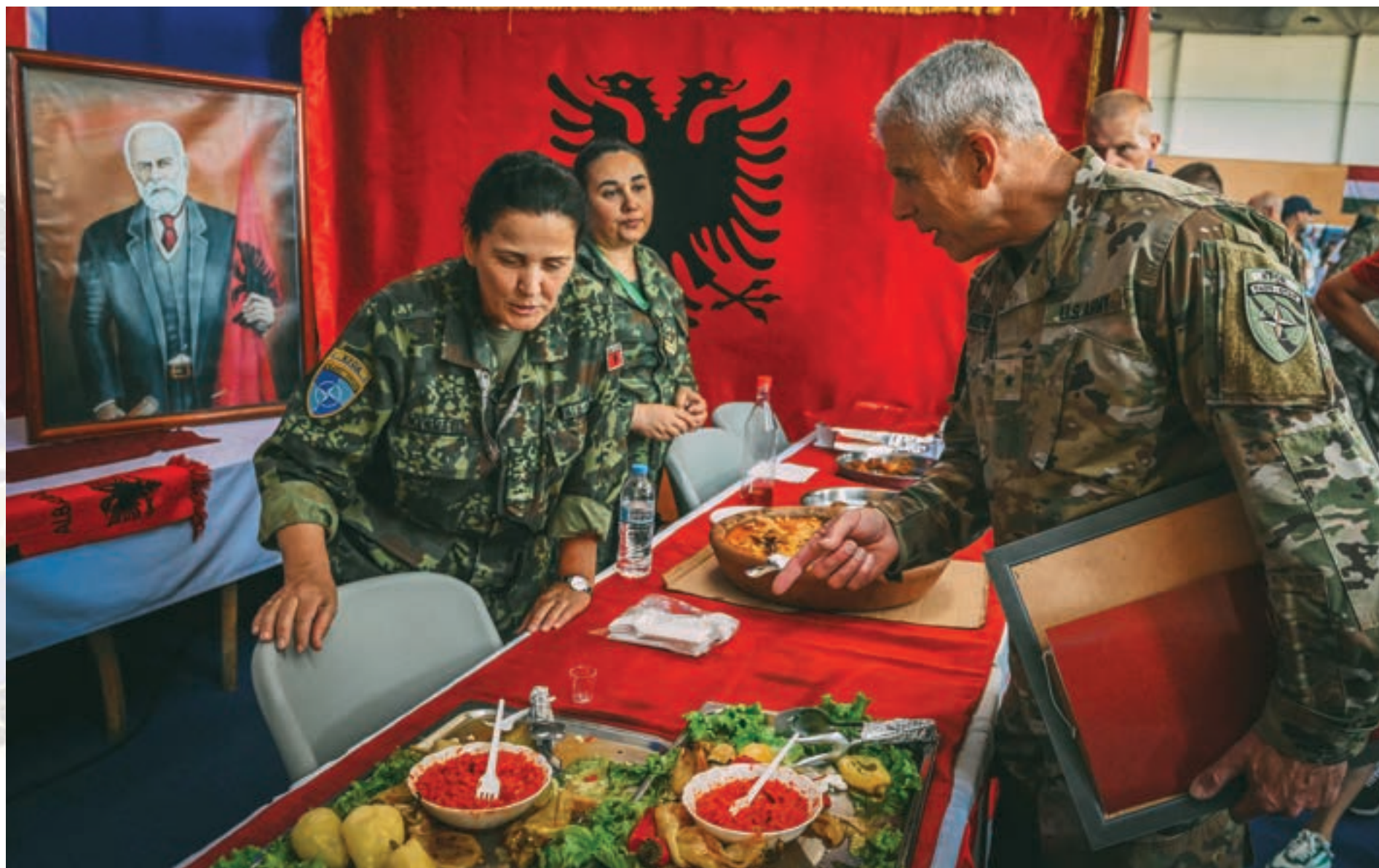
Albanian stand at KFOR International Day in KFOR HQ