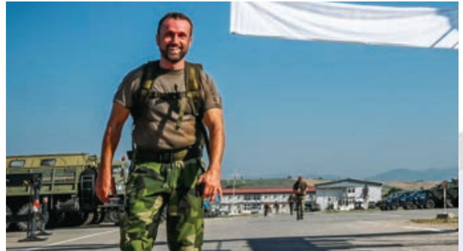
KFOR soldiers at the DANCON March