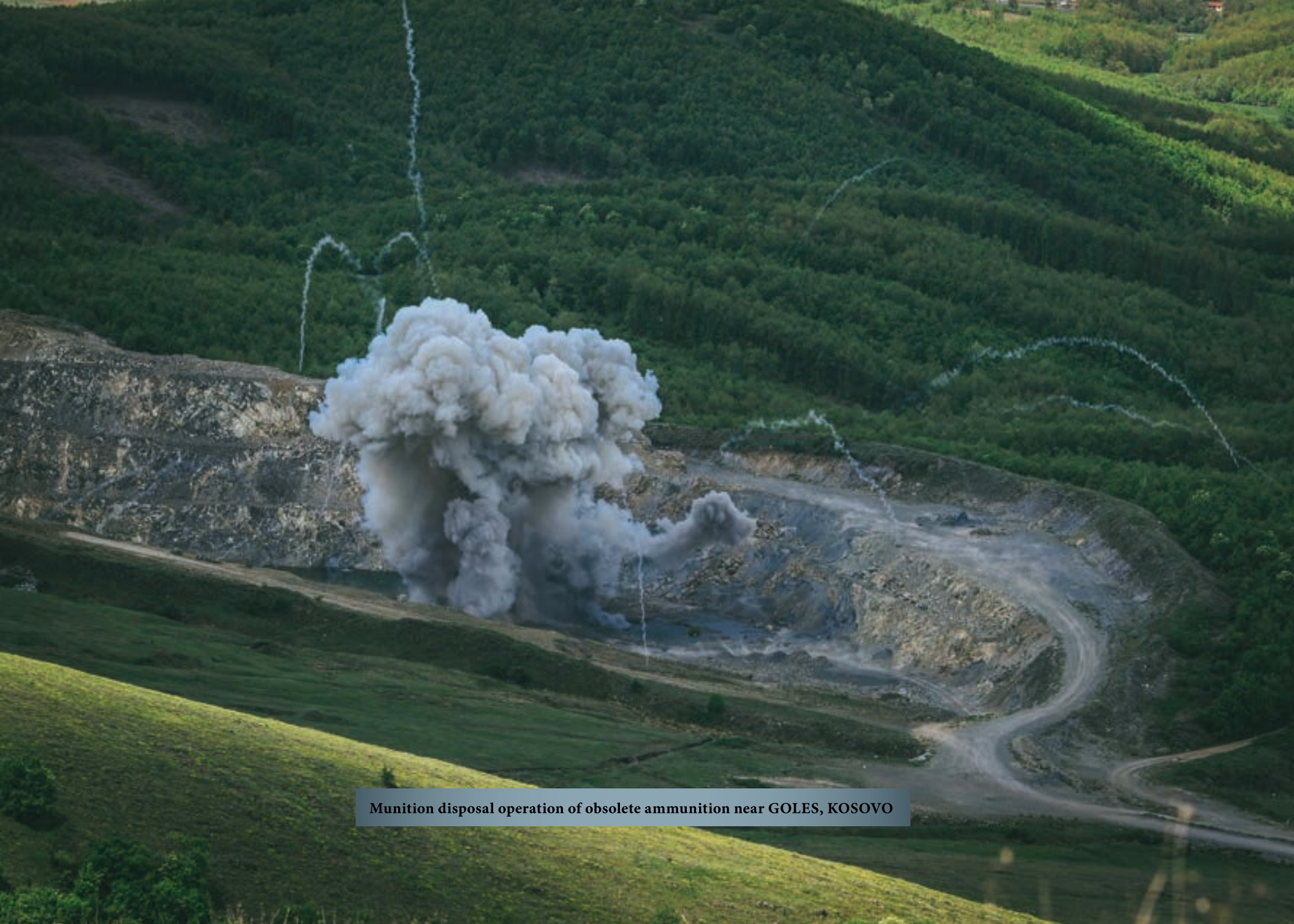
Munition disposal operation of obsolete ammunition near GOLES, KOSOVO