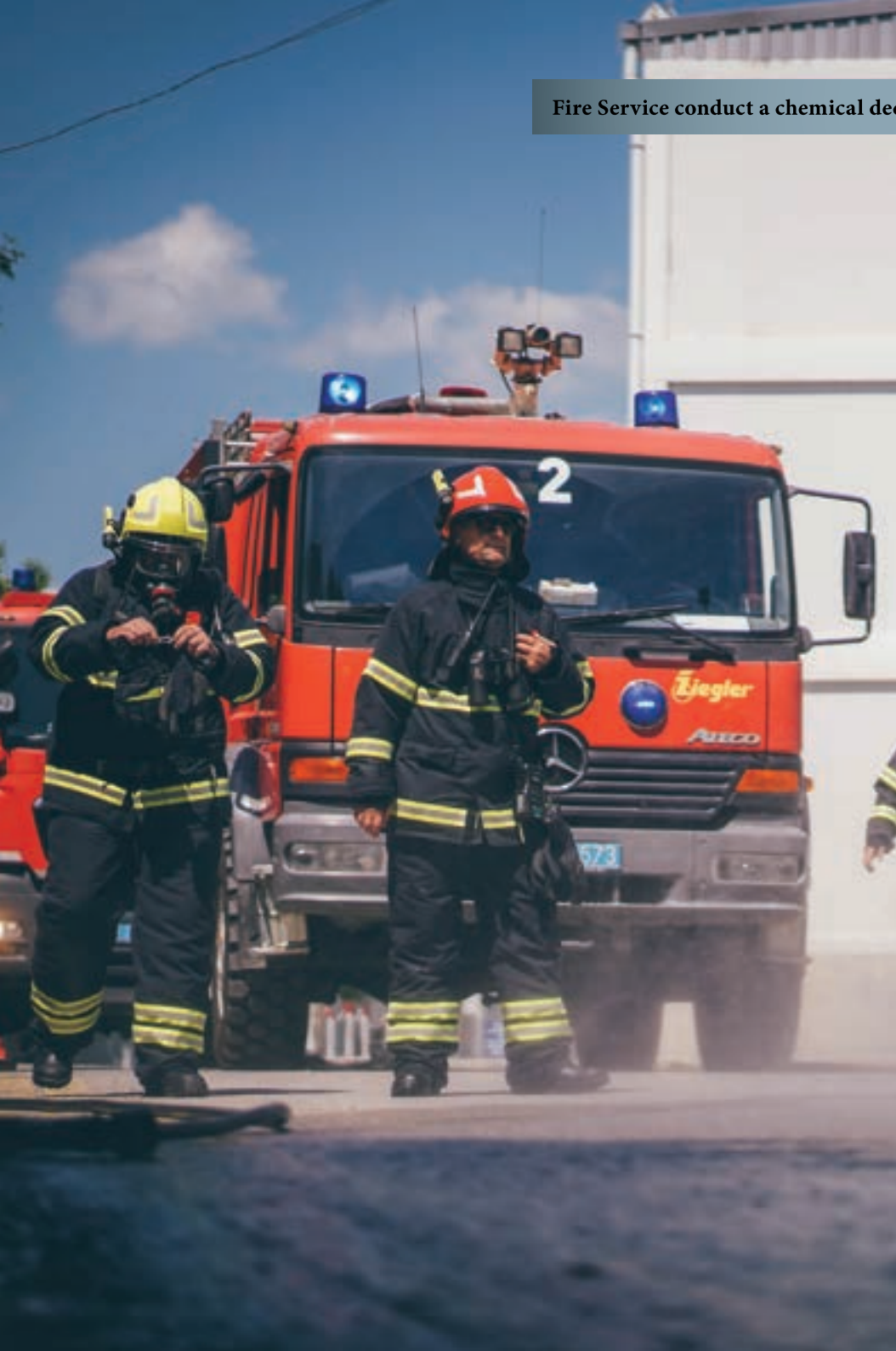
Fire Service conduct a chemical decontamination exercise in KFOR HQ