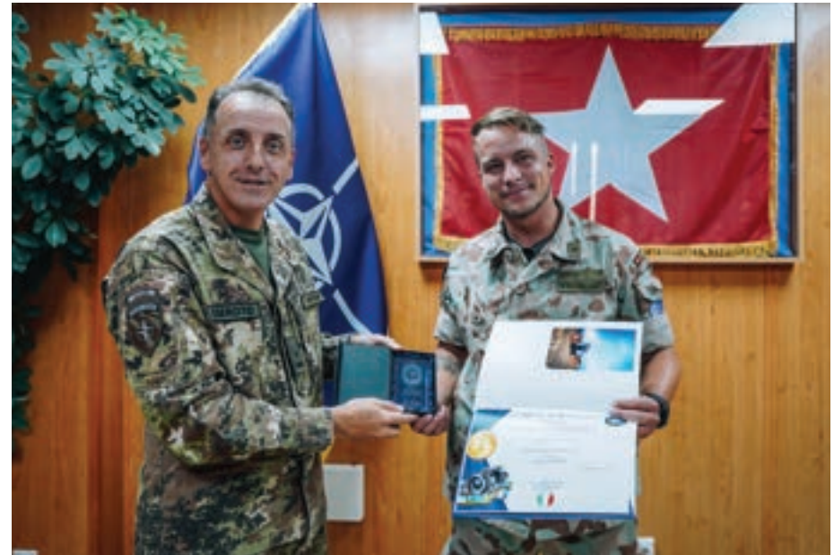
DCOM presents award to the Winner of KFOR Photo Competition to member of Swiss Coy