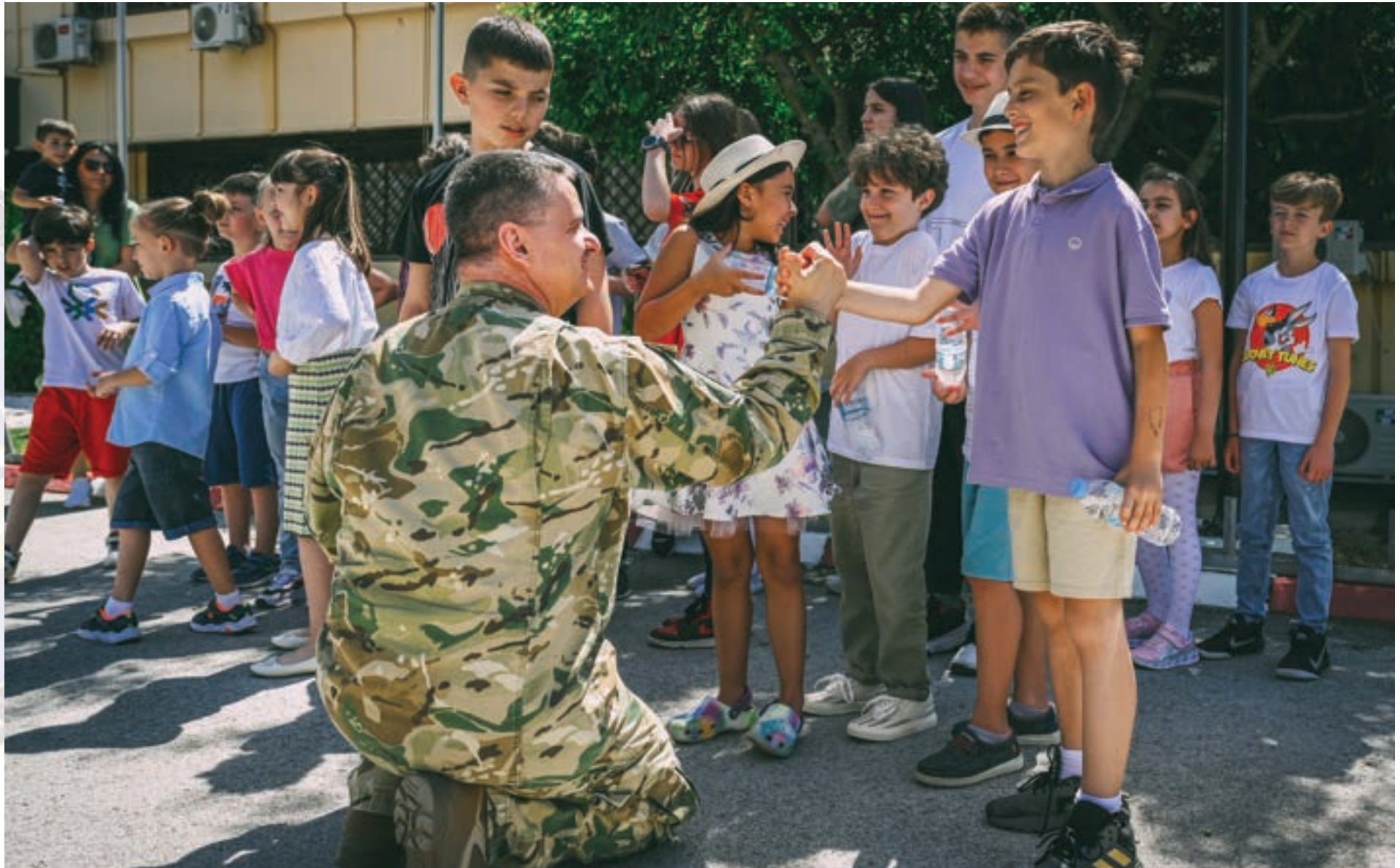
COM KFOR greets children at International Children's Day in KFOR HQ