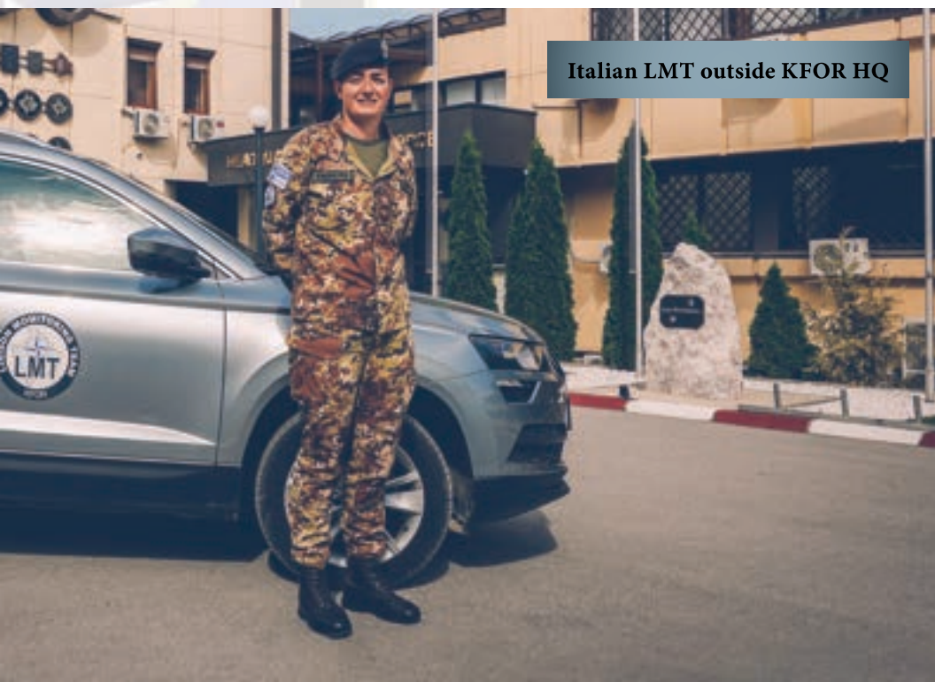
Italian LMT outside KFOR HQ