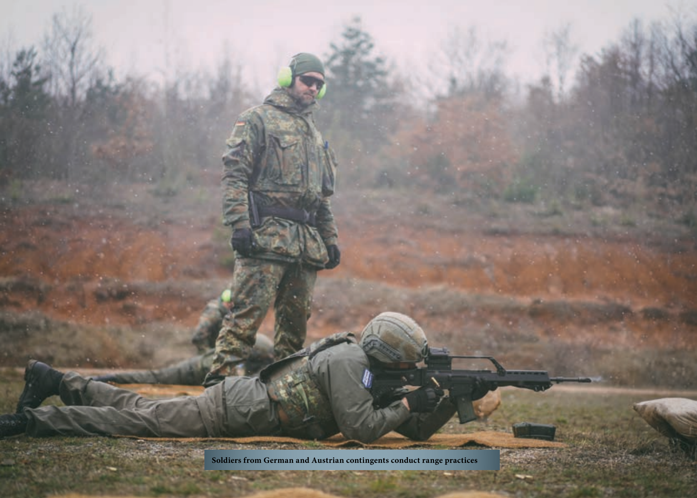
Soldiers from German and Austrian contingents conduct range practices