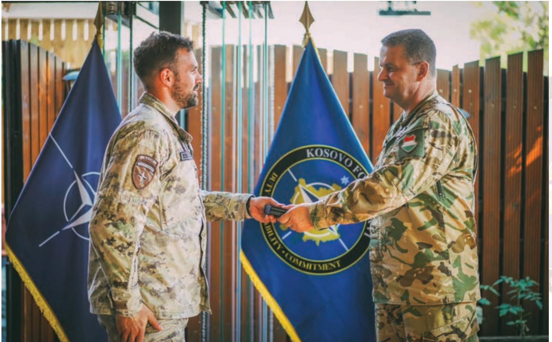
Italian NCO receives a coin from COM KFOR