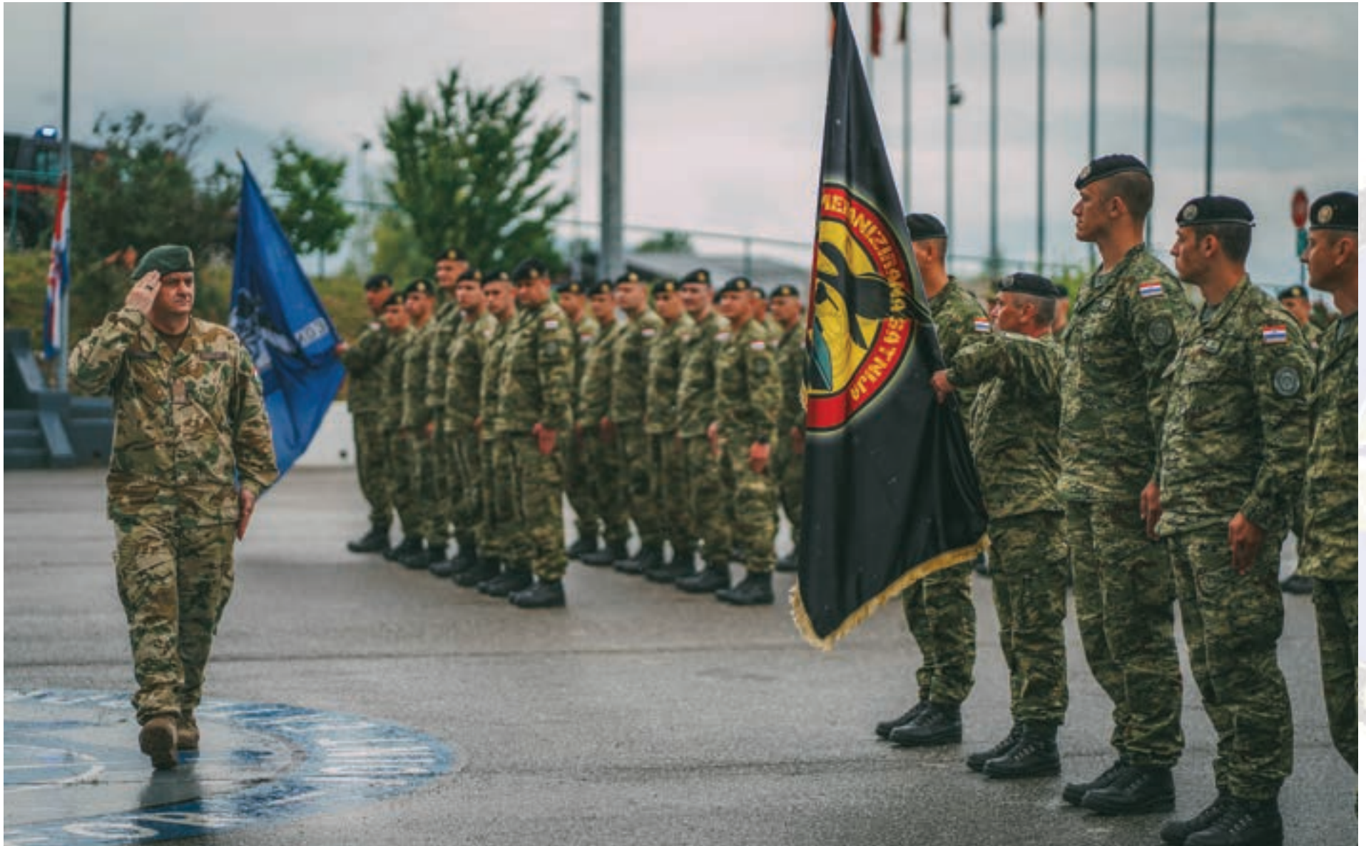
COM KFOR at Croatian Medal Parade