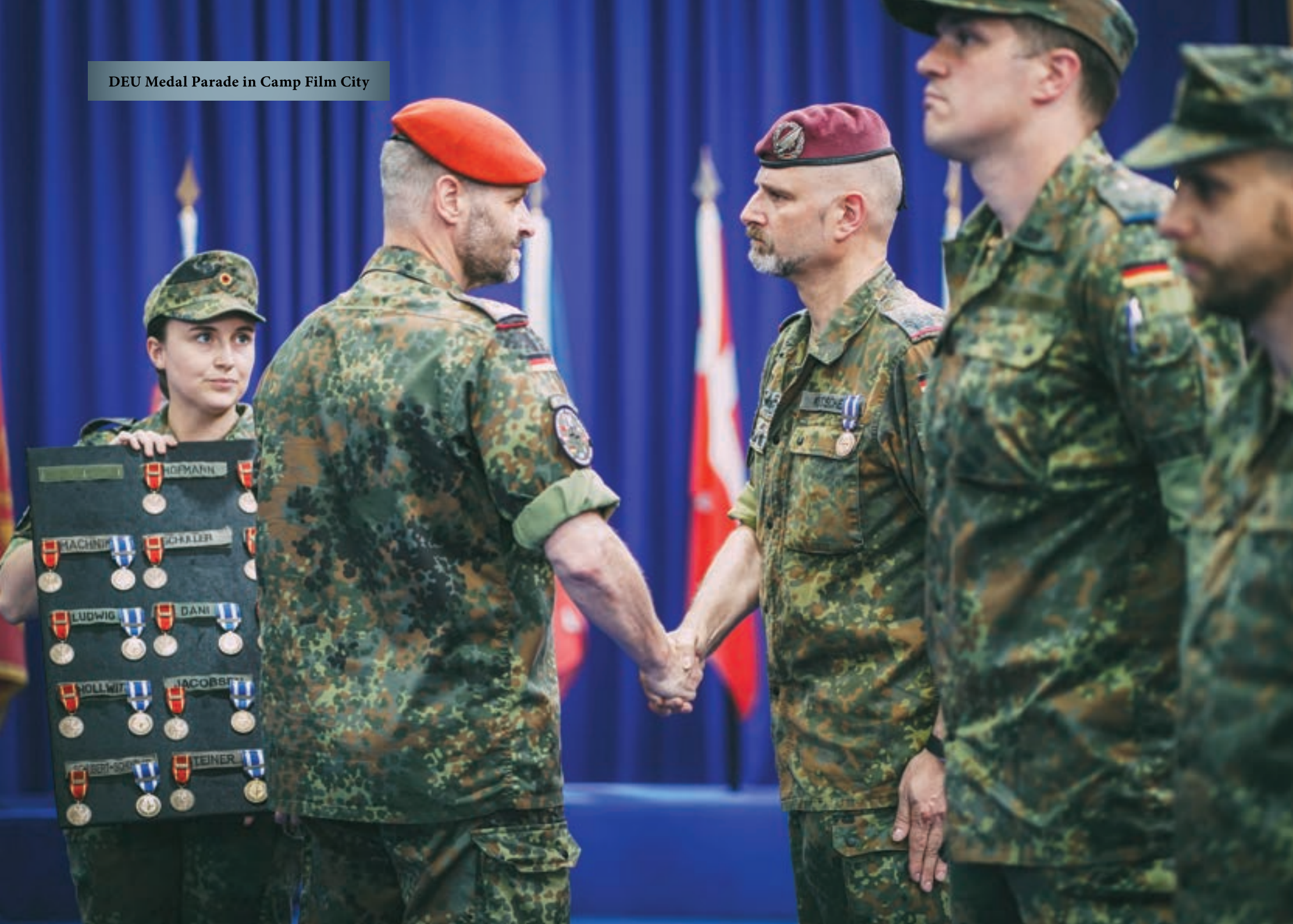
DEU Medal Parade in Camp Film City