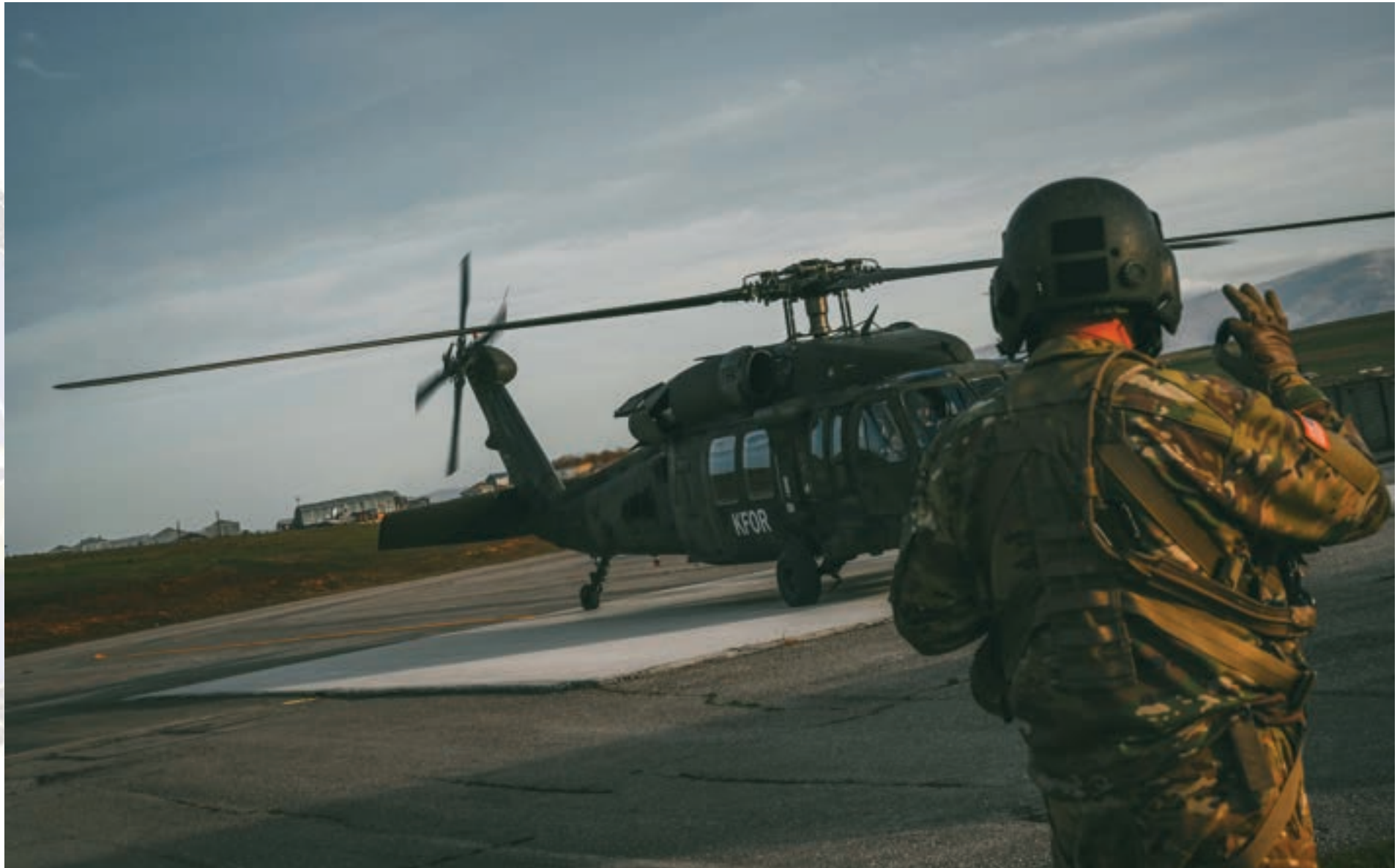
US Black Hawk Helicopter