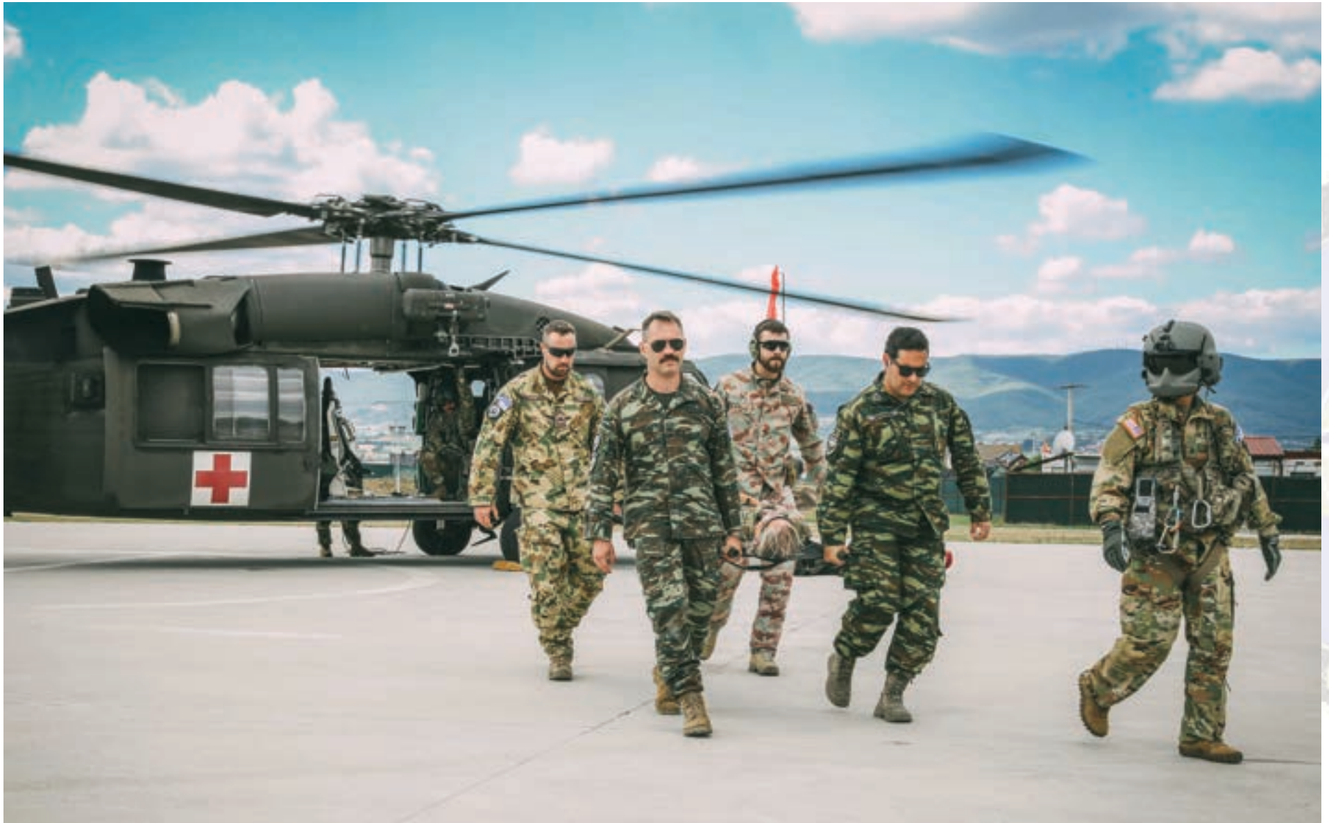
MEDEVAC training exercise