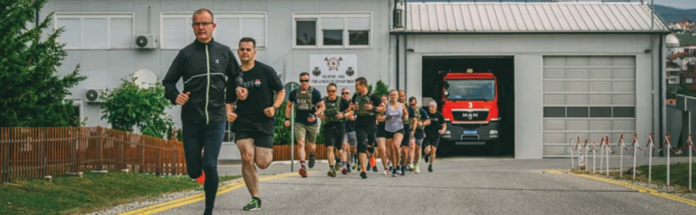
Murph Challenge at KFOR HQ