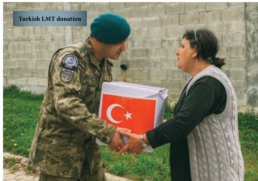
Turkish LMT donation