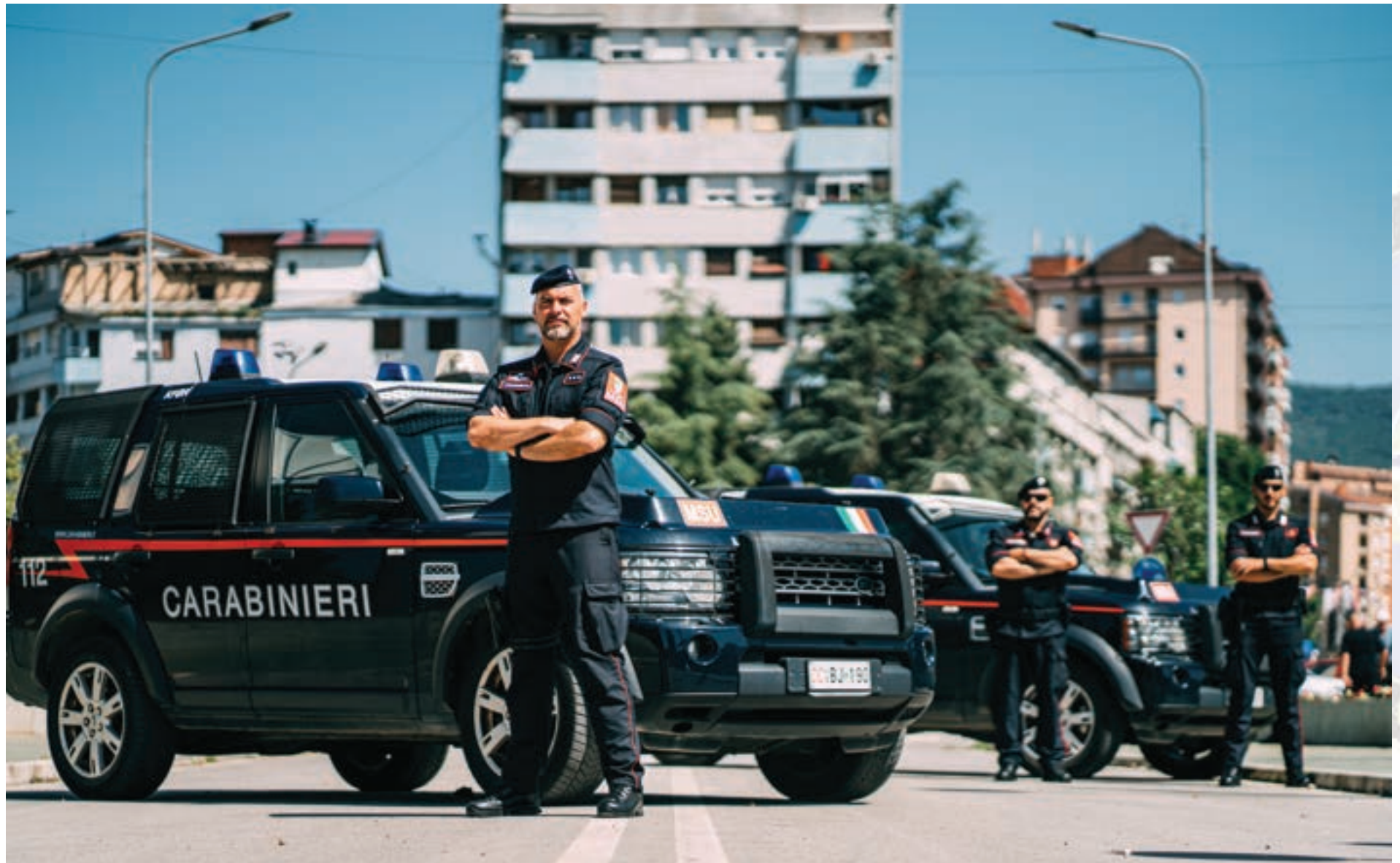
Carabinieri from Multinational Specialized Unit on Patrol