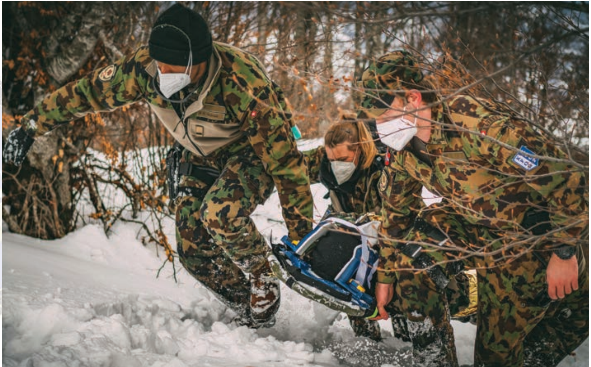
Swiss medics conduct a MEDEVAC training exercise