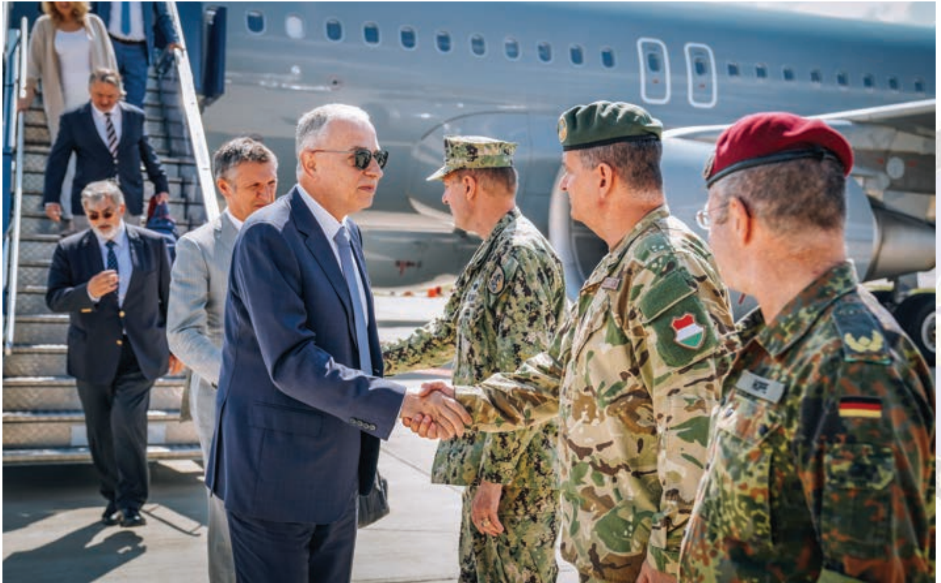
COM JFCNP, COM KFOR and NALT Director greet NAC Visit to KFOR HQ