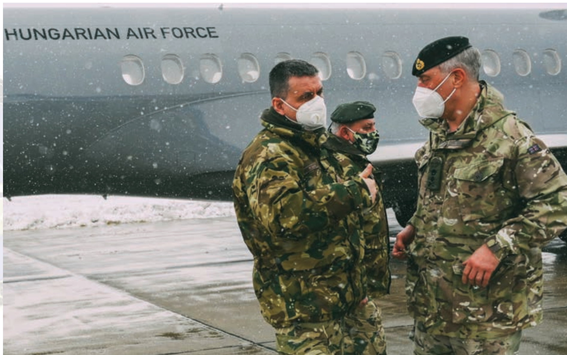
COM KFOR receives DSACEUR