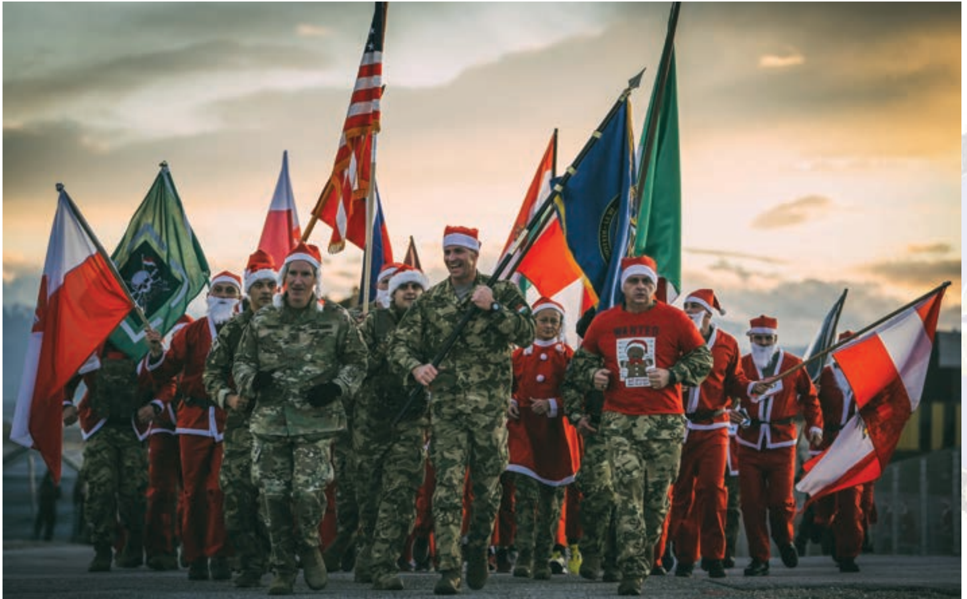
Santa Charity run KFOR HQ