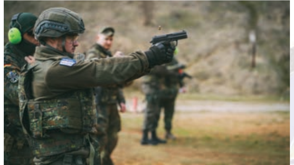
German Soldier fires his pistol on the range