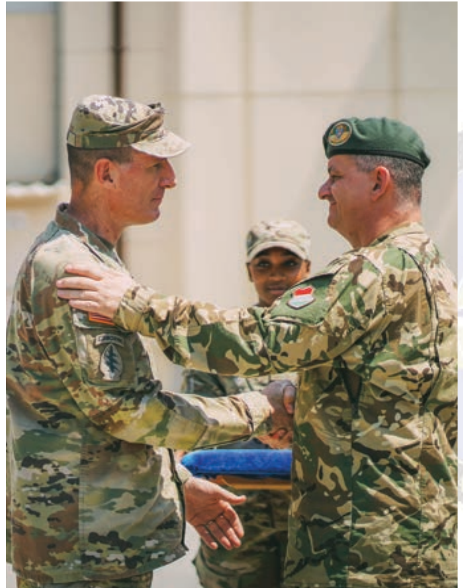
COM KFOR thanks COS for his service