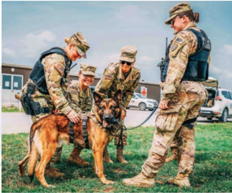
US Military Police on Patrol in Camp Bondsteel