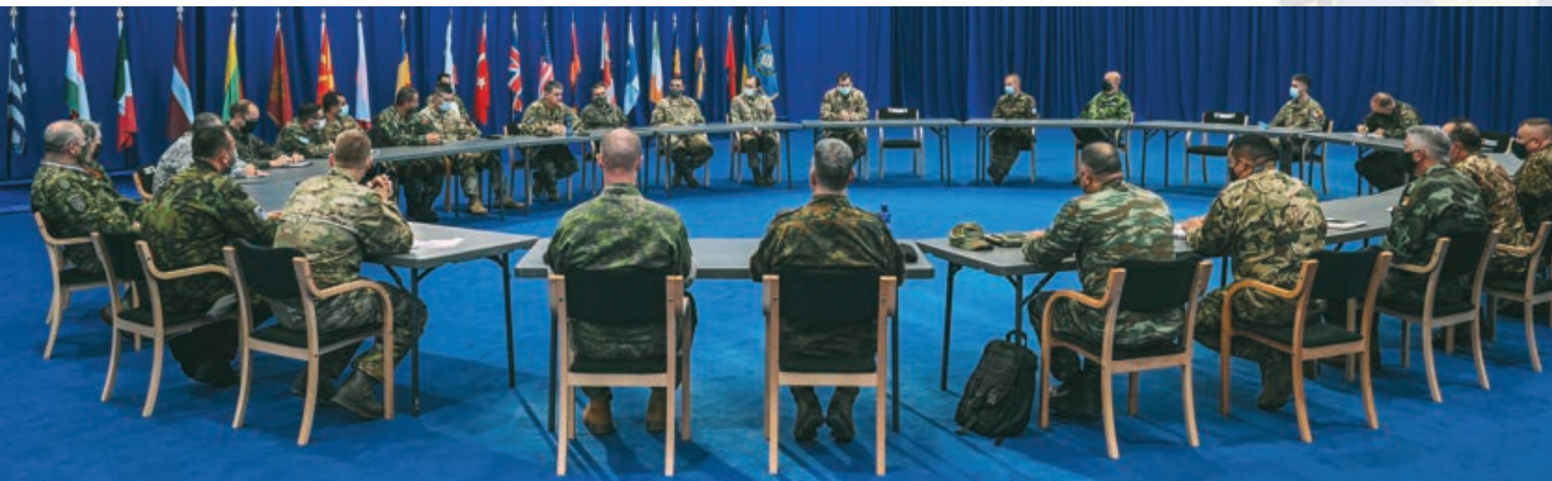
COM KFOR meeting with SNRs