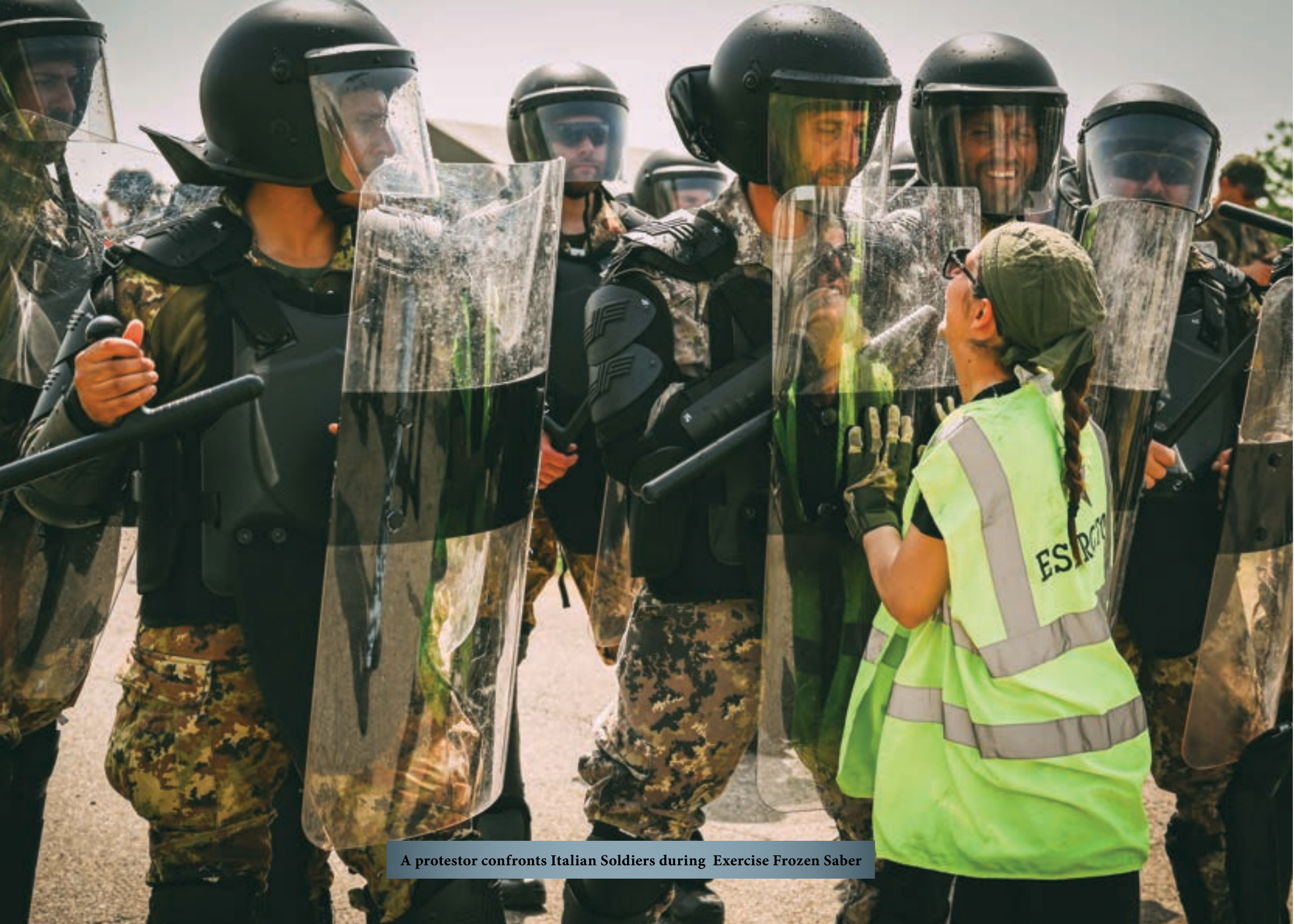
A protestor confronts Italian Soldiers during Exercise Frozen Saber