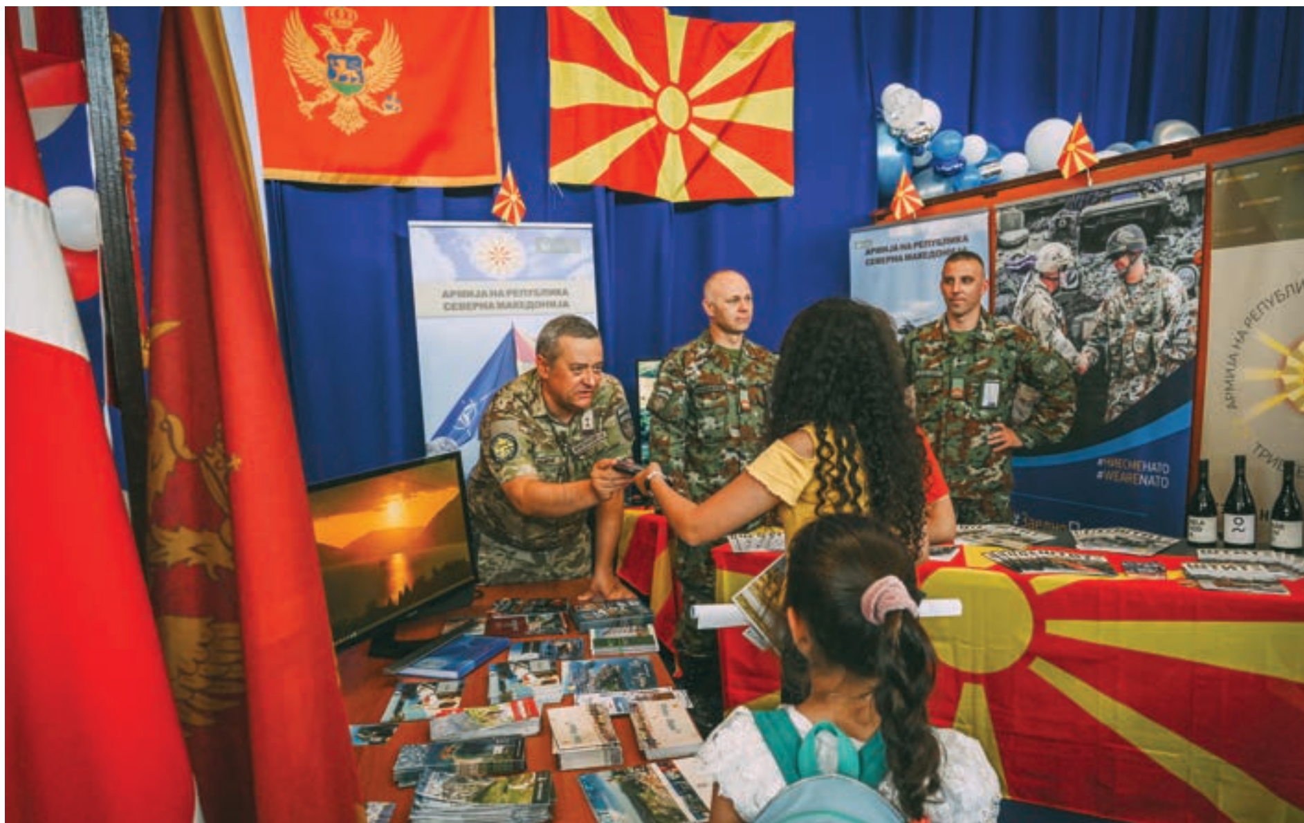
Soldiers from Montenegro and North Macedonia stands at KFOR International Day in KFOR HQ