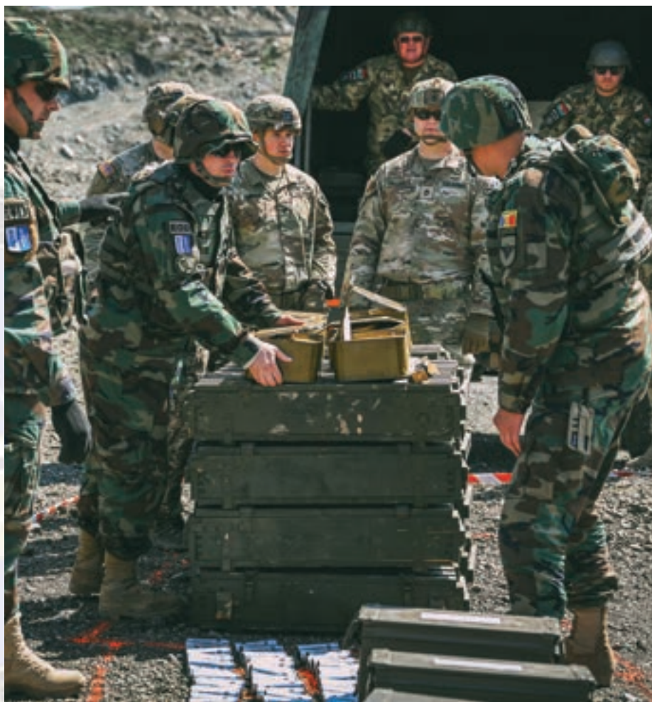
Multinational EOD Team prepare a conventional munition disposal