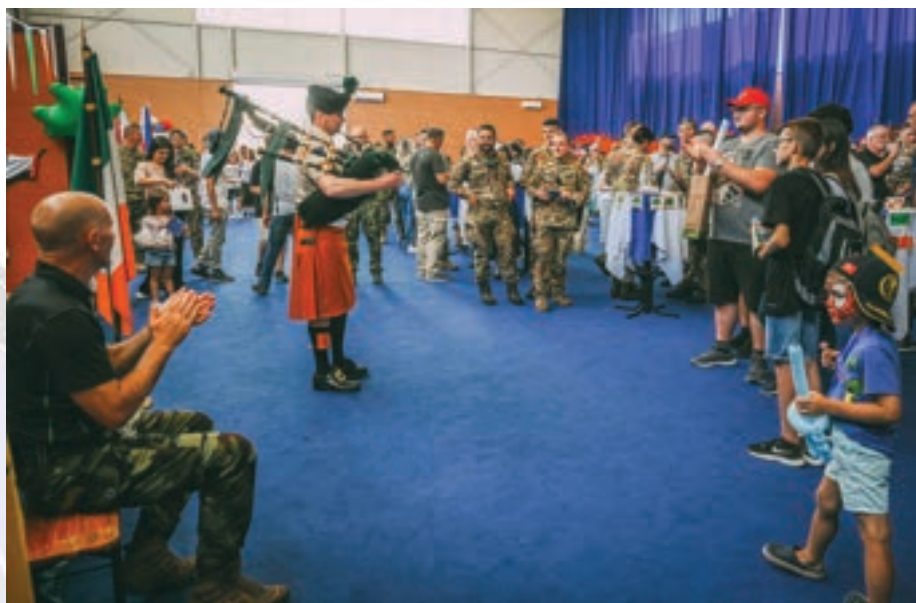
Irish piper at KFOR International Day in KFOR HQ