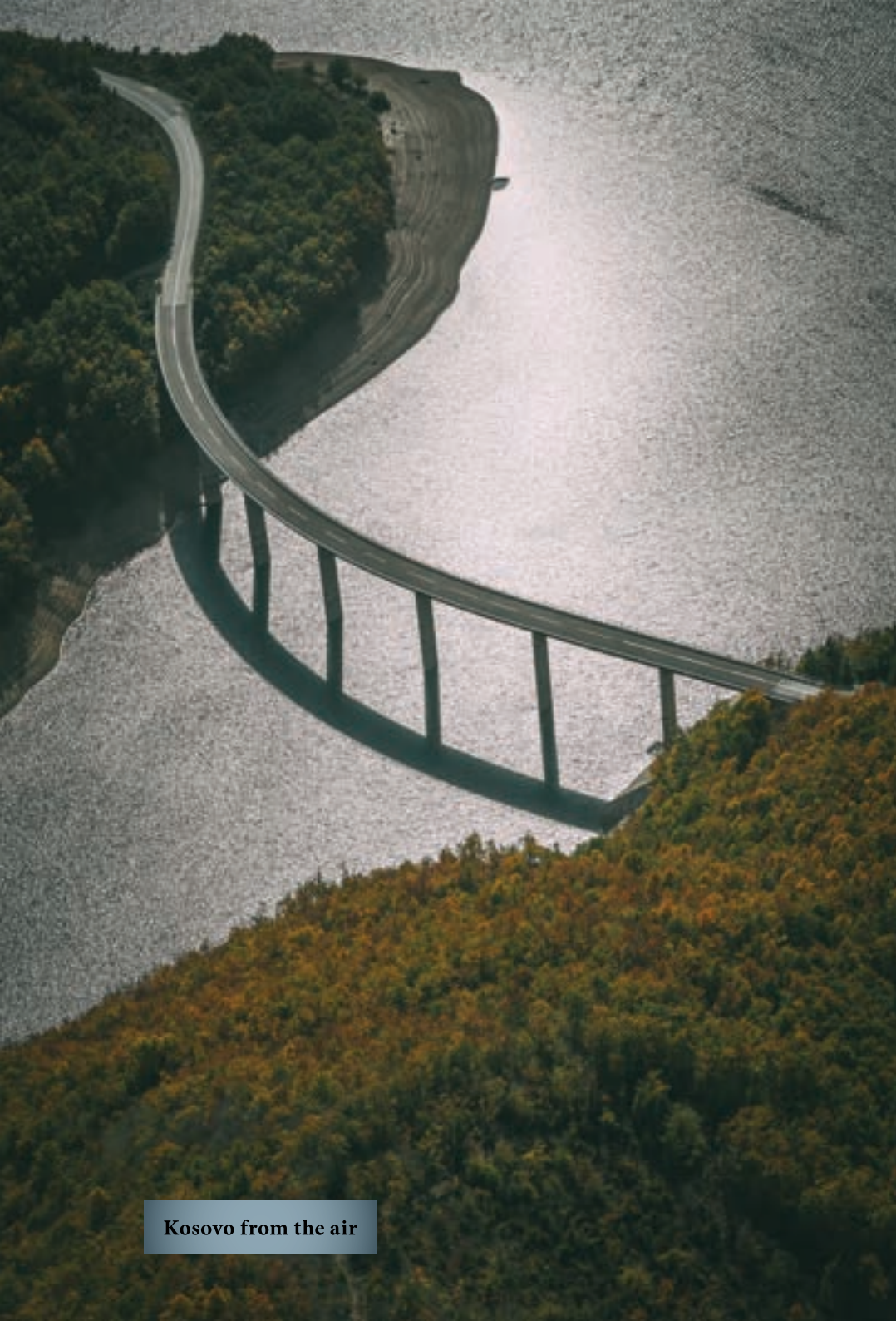
Kosovo from the air