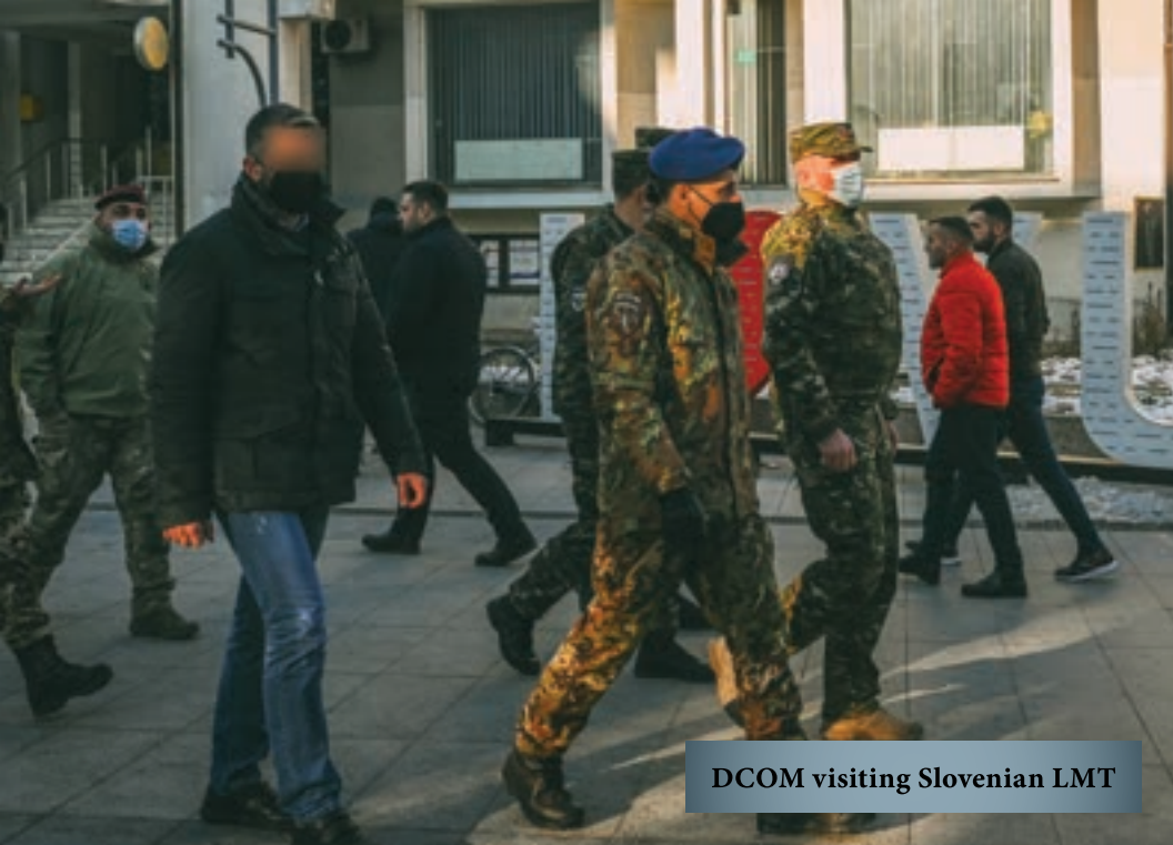
DCOM visiting Slovenian LMT