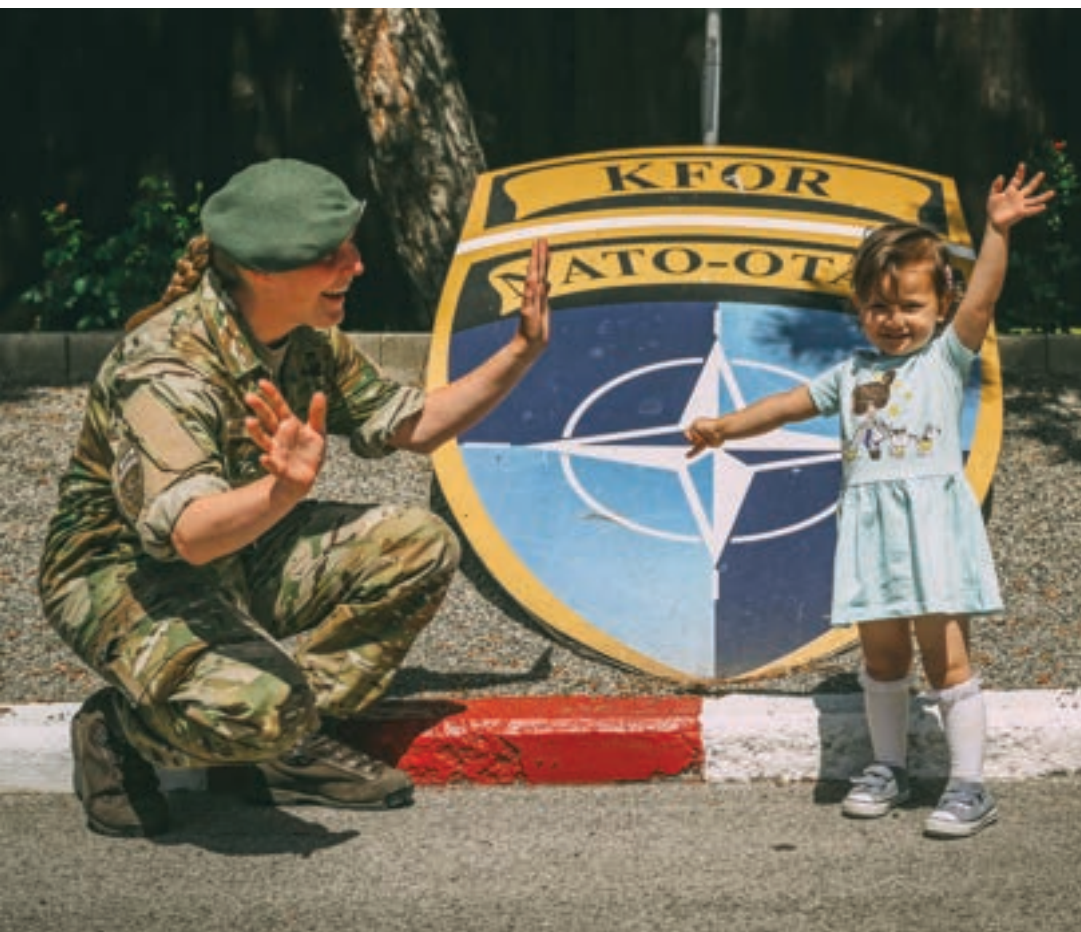
Danish soldier at International Children's Day in KFOR HQ