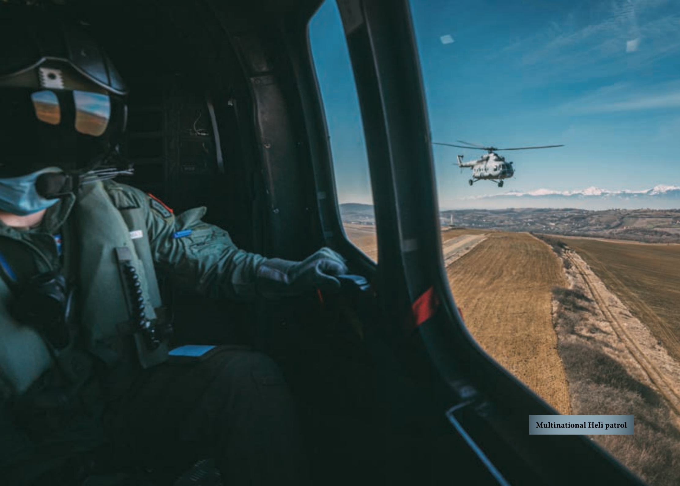
Multinational Heli patrol