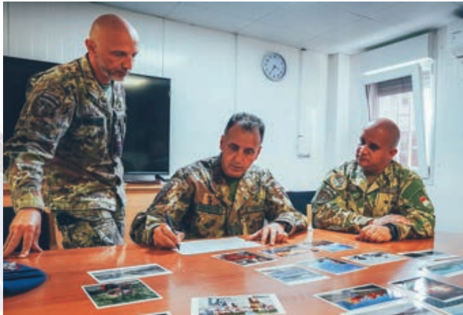
DCOM and Judges of the KFOR Photo Competition