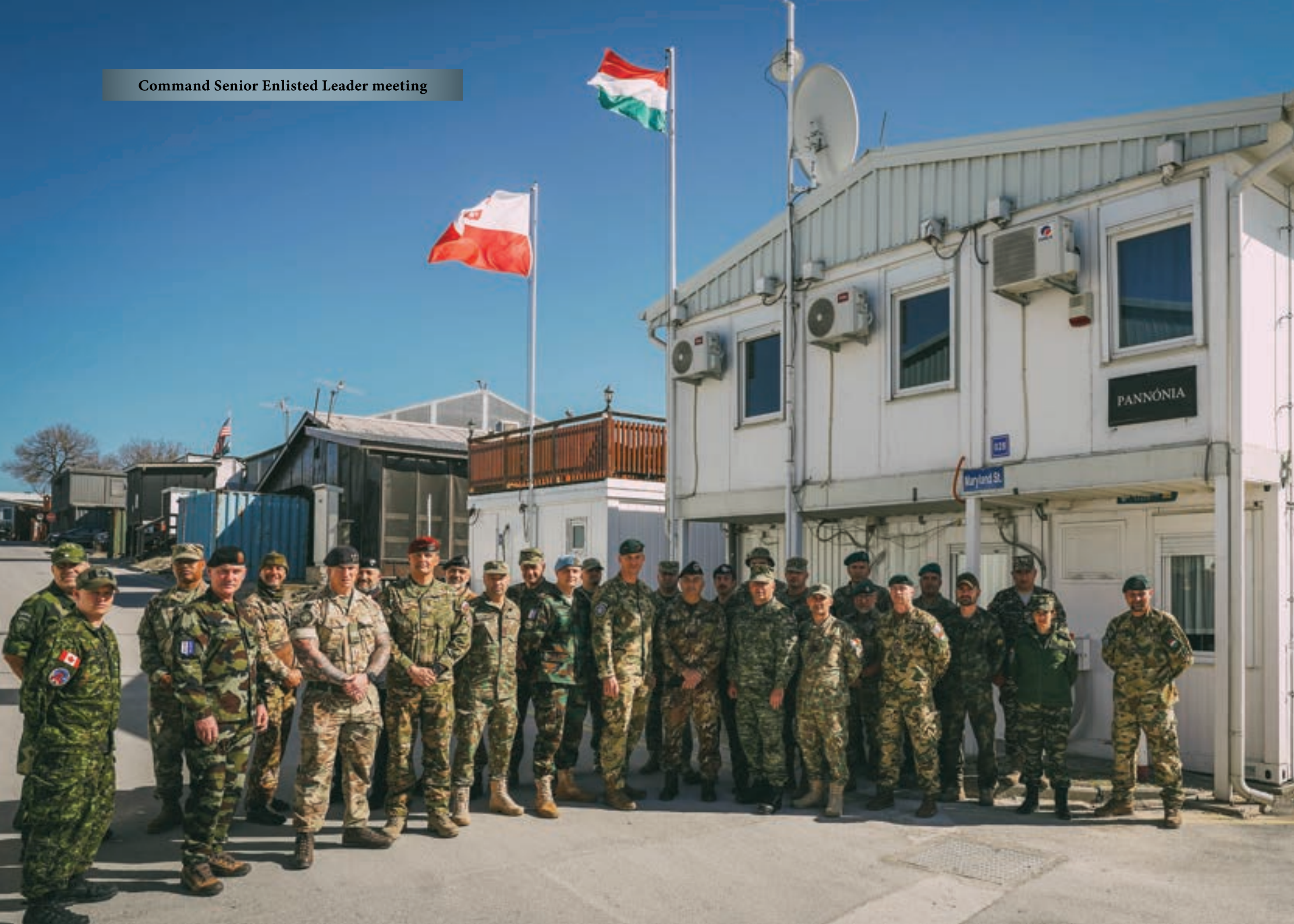
Command Senior Enlisted Leader meeting