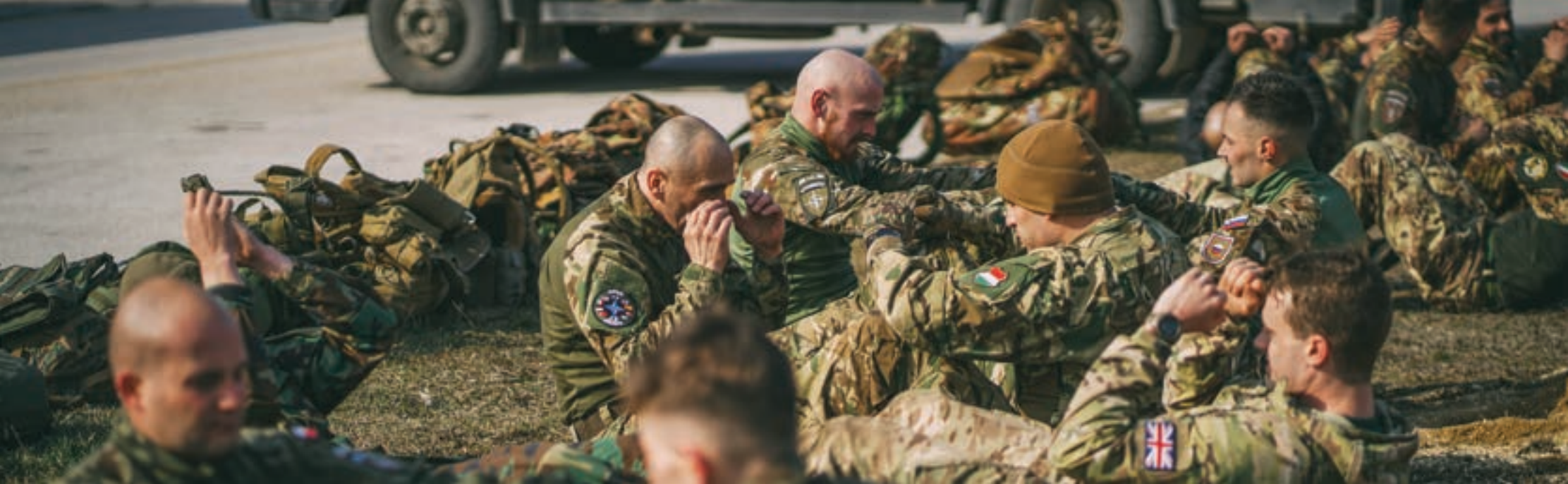
KFOR Invictus Challenge at KFOR HQ