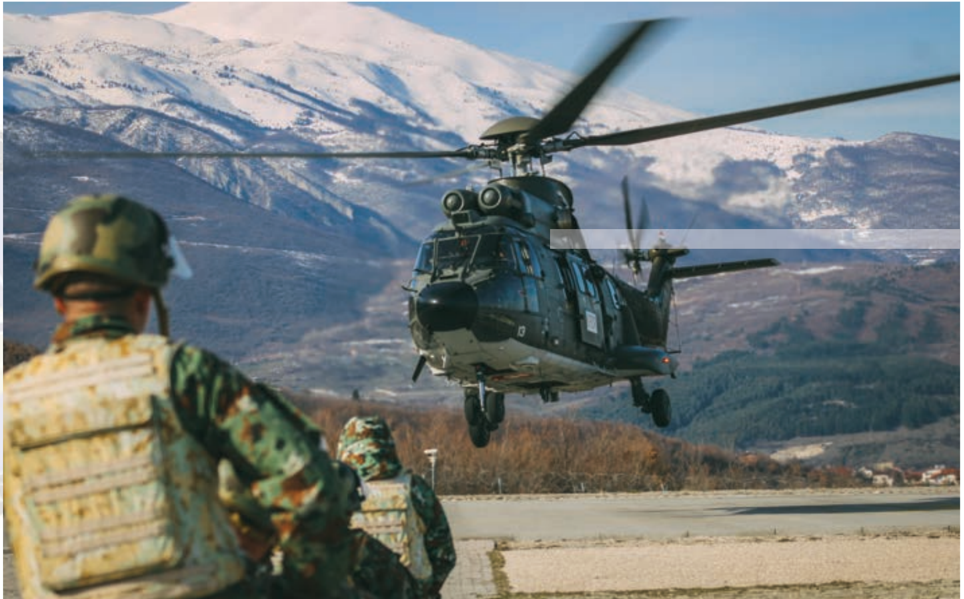
Soldiers from North Macedonia on exercise at Camp Villaggio Italia