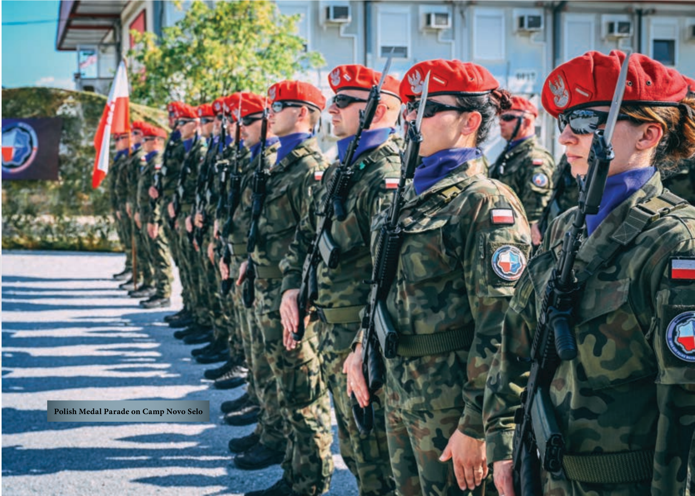
Polish Medal Parade on Camp Novo Selo