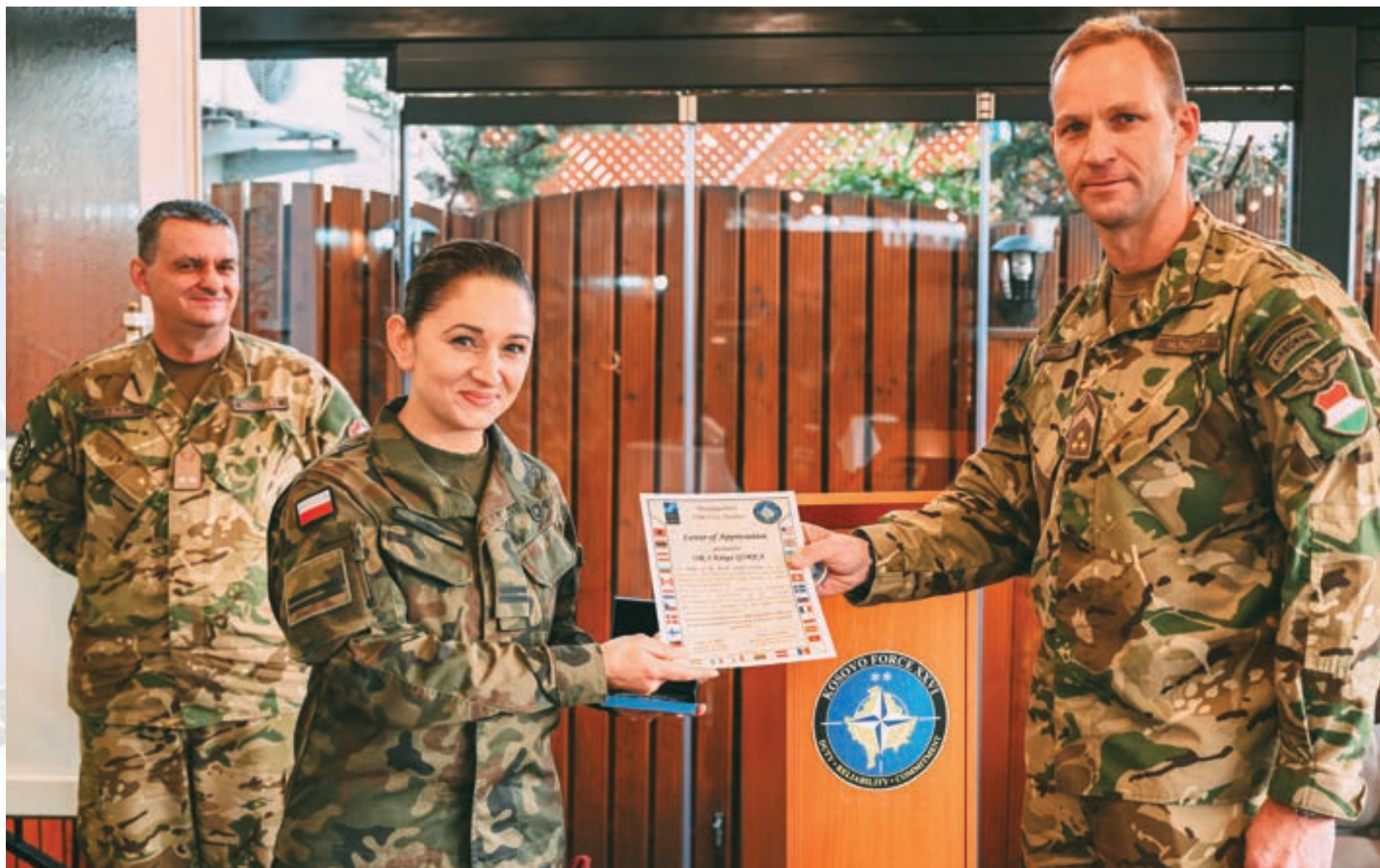
Polish soldier receives a Letter of Appreciation from CSM & COM KFOR