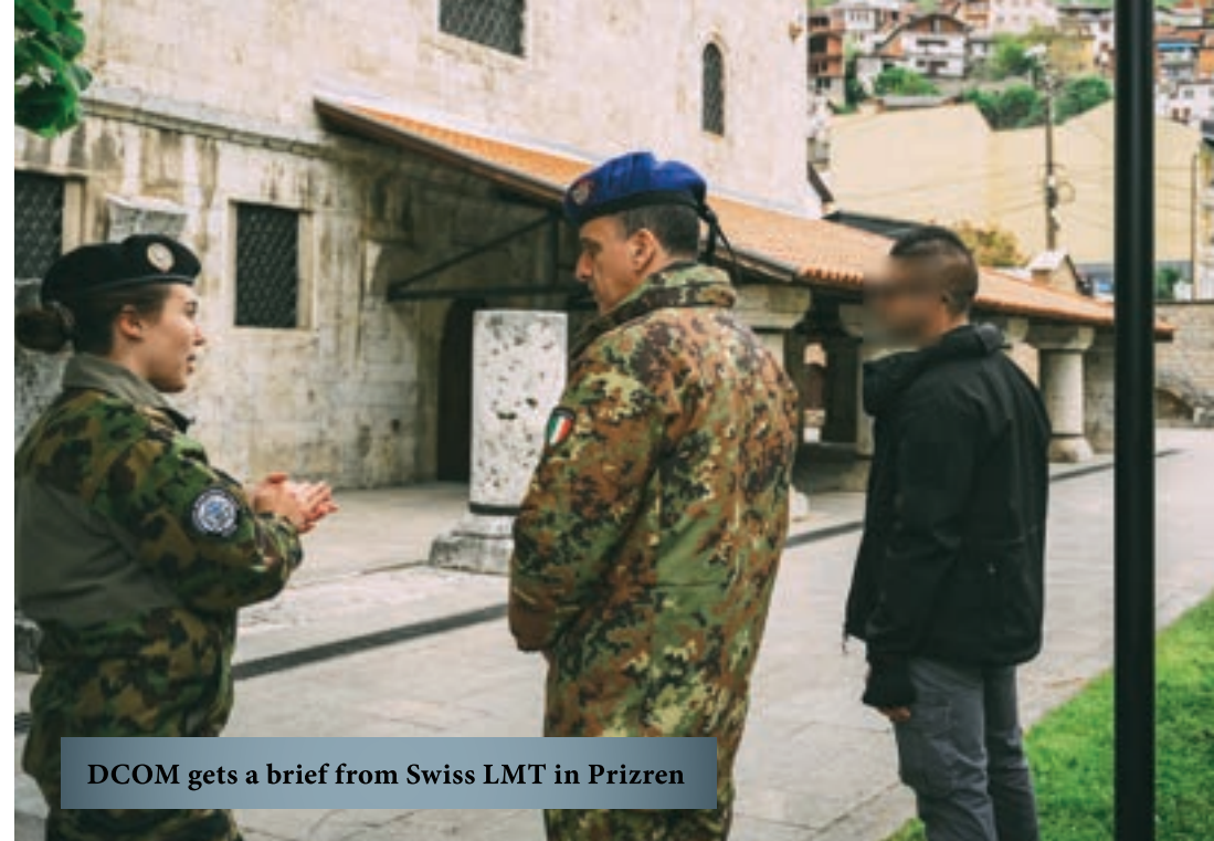
DCOM gets a brief from Swiss LMT in Prizren