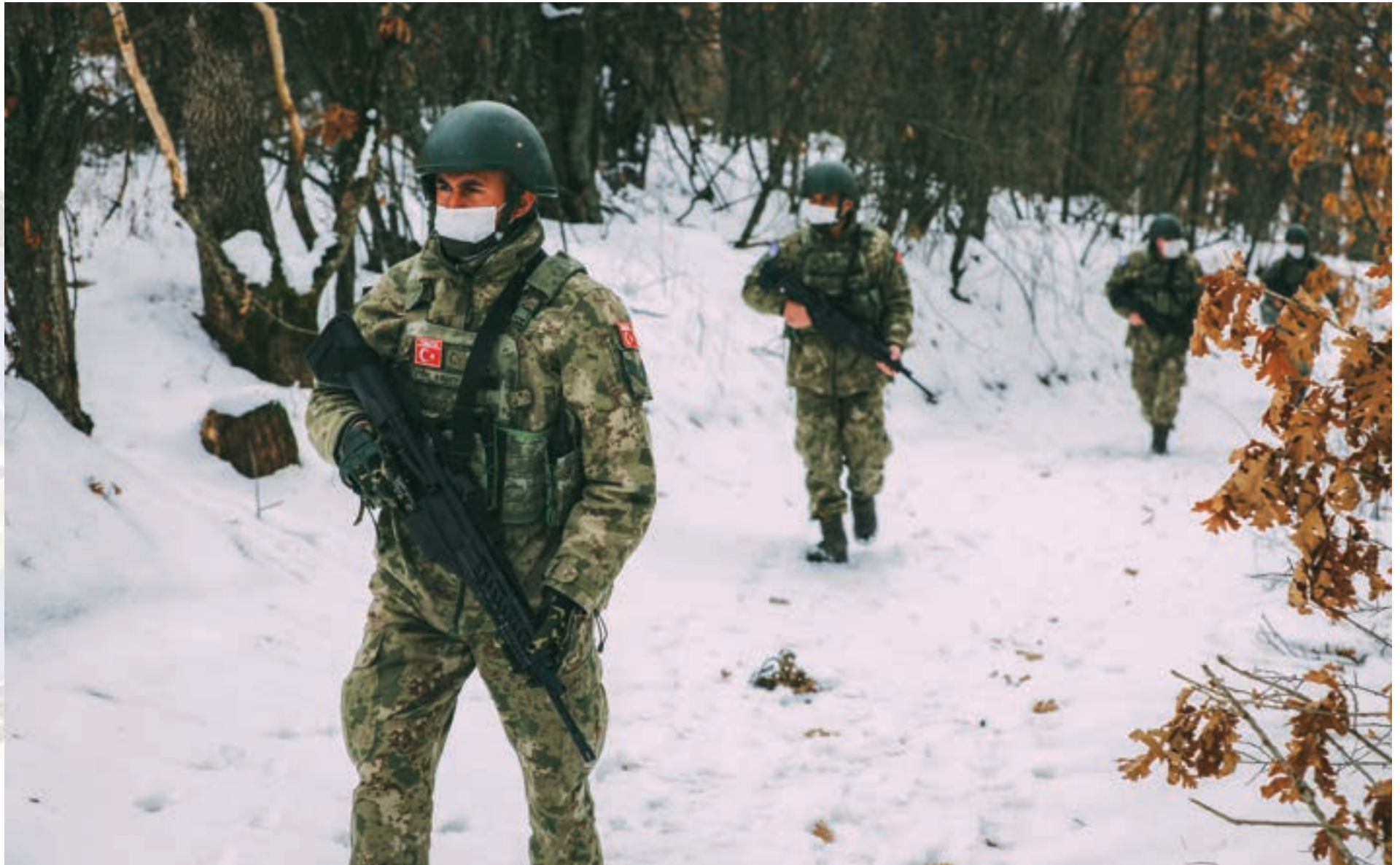
Turkish Soldiers conduct a foot Patrol in RC-East