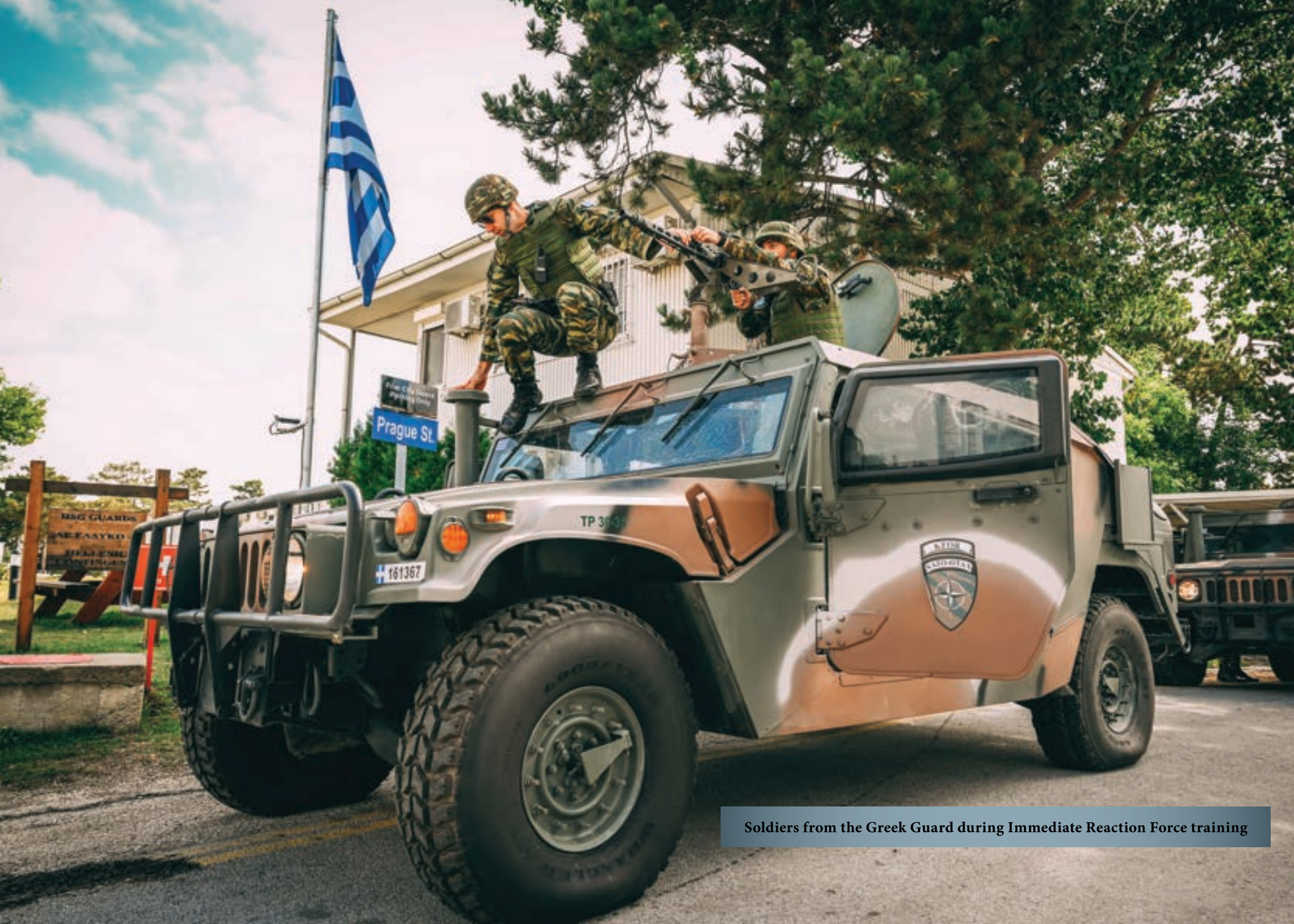
Soldiers from the Greek Guard during Immediate Reaction Force training