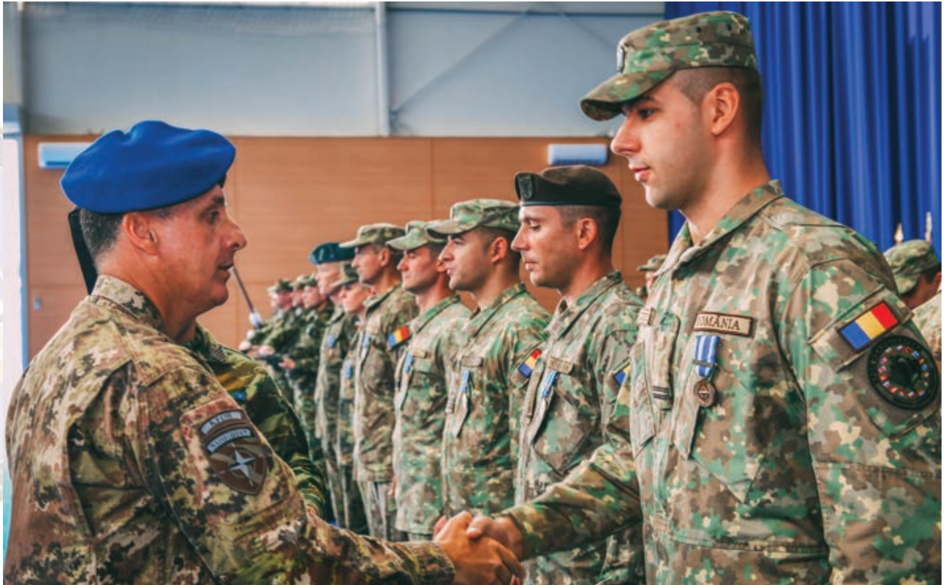
DCOM at KFOR HQ Medal Parade