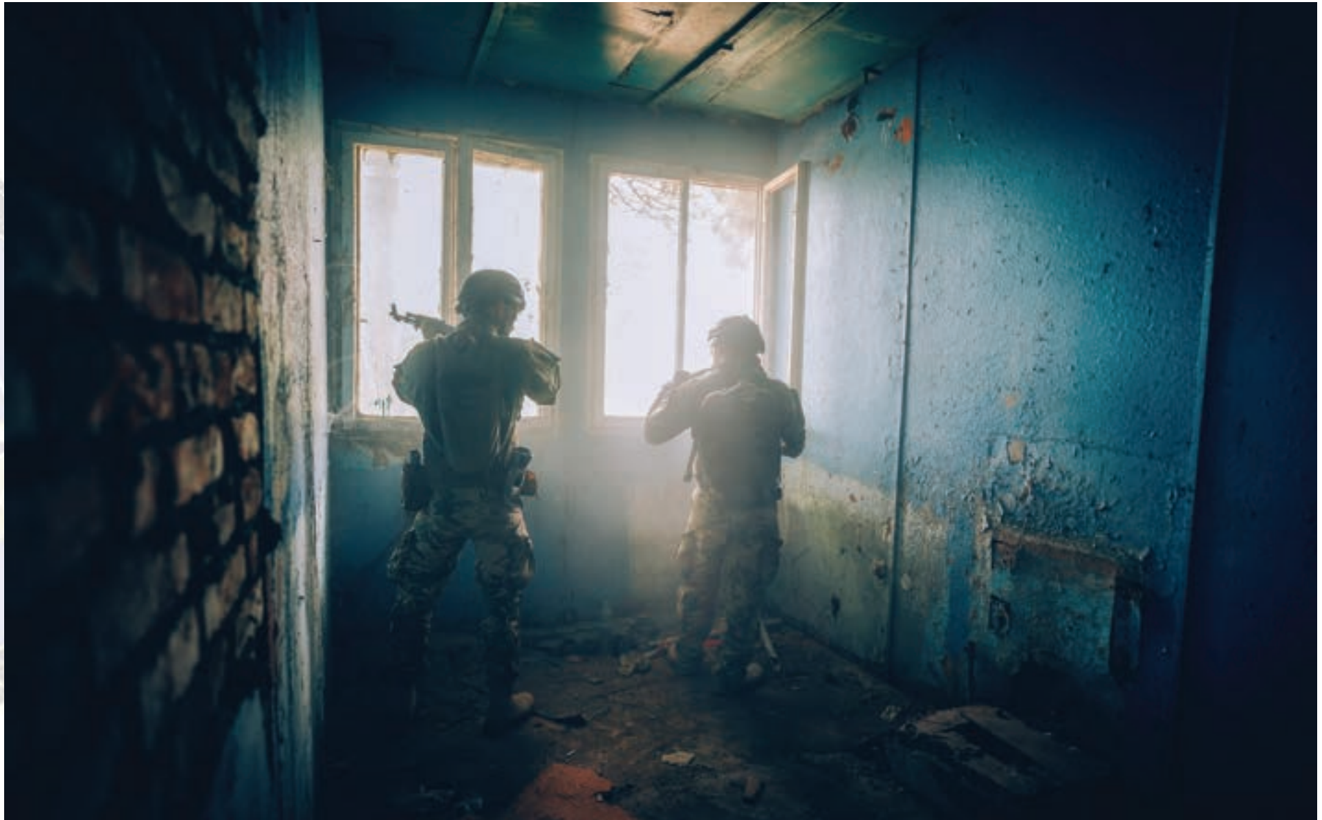
Hungarian soldiers from KTRBN on exercise