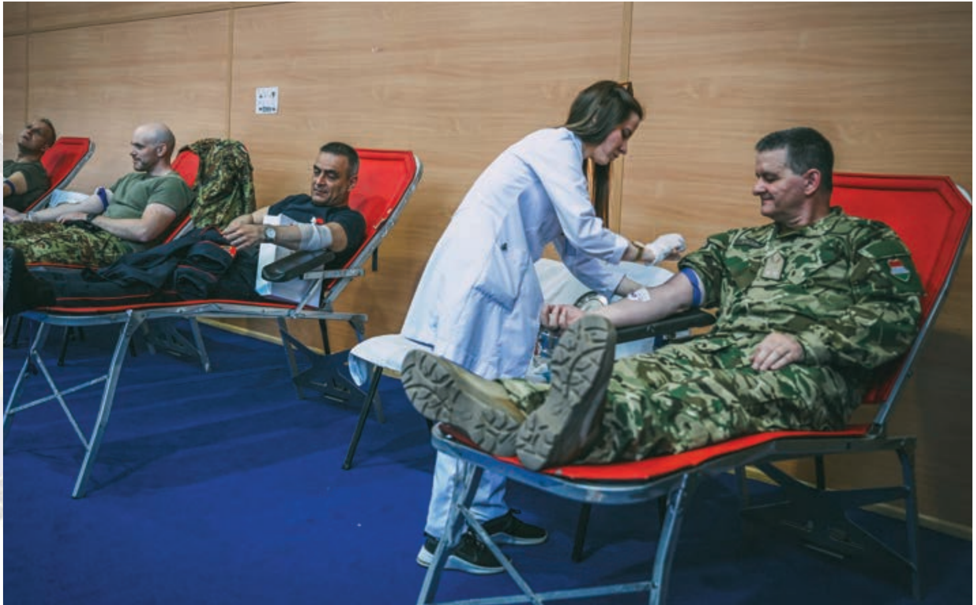
Blood Donation at KFOR HQ