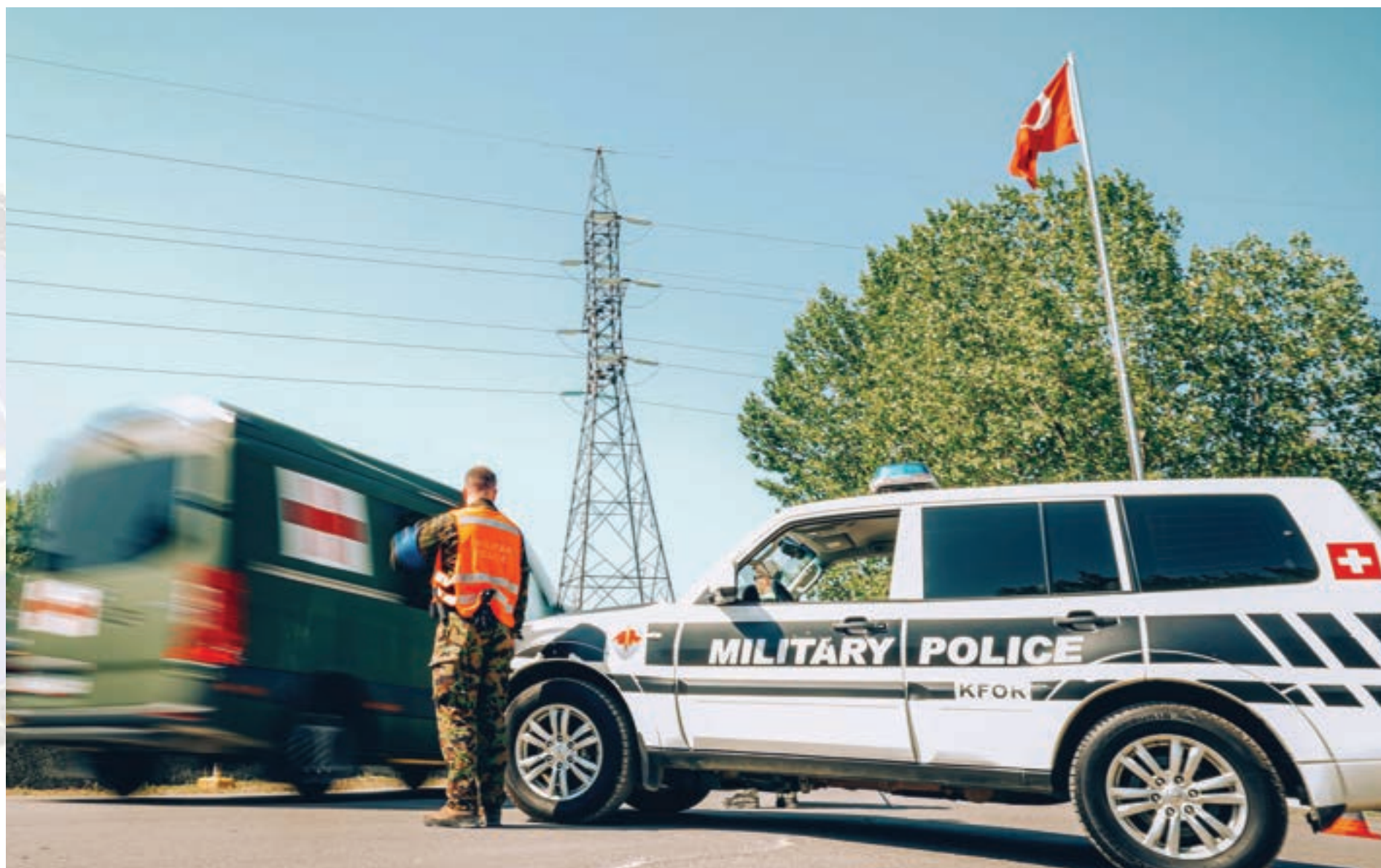
Emergency Responders during MASCAL Exercise in KFOR HQ