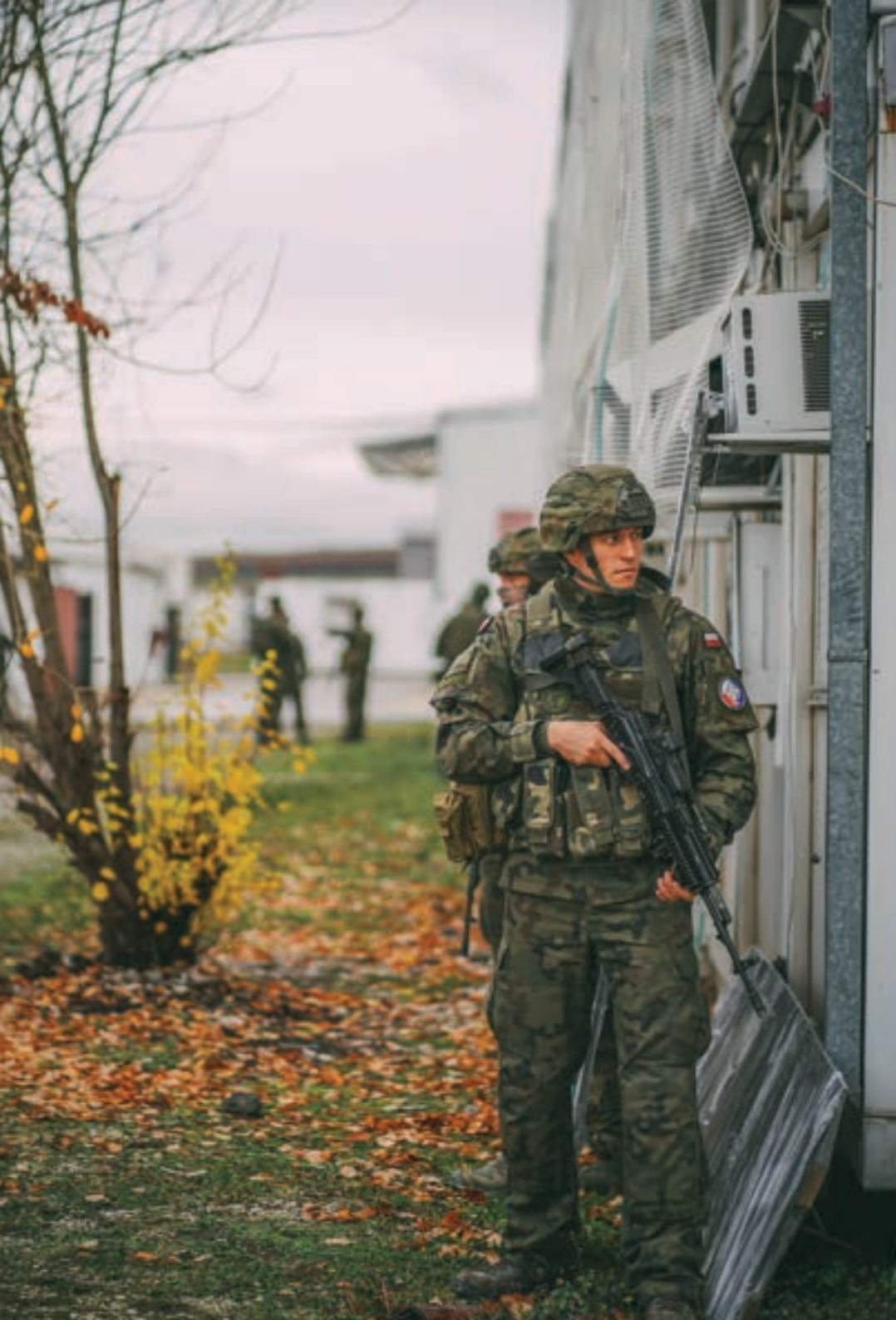
A Polish soldier keeps watch on exercise