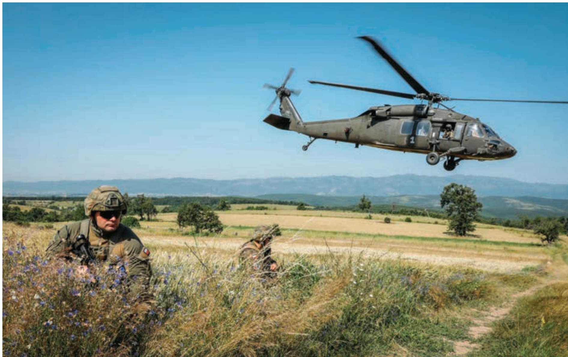
Polish soldiers conduct a Patrol after Heli Insertion