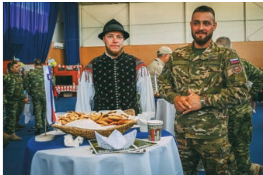
Slovenian stand at KFOR International Day in KFOR HQ