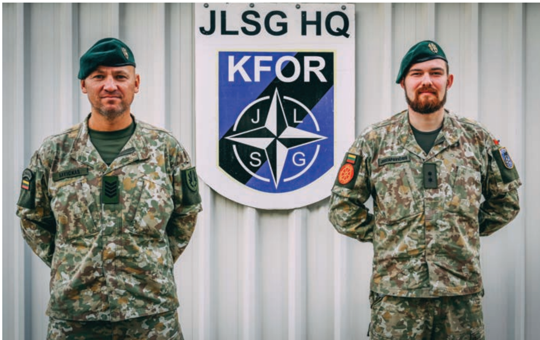
Lithuanian soldiers from JLSG