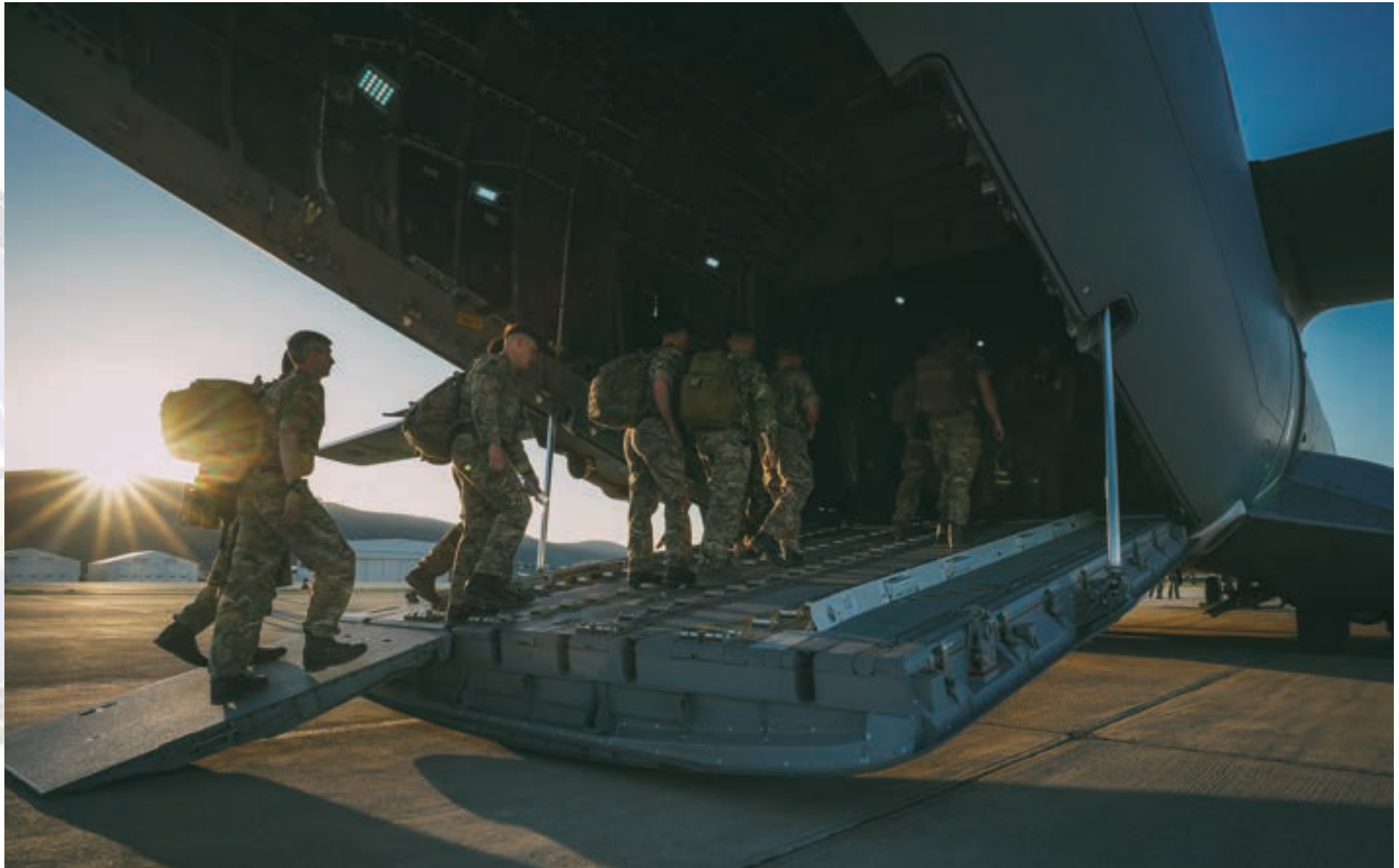
Rotation of British Contingent