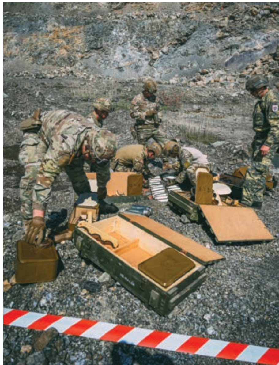
US and Austrian EOD Team prepare for munition disposal