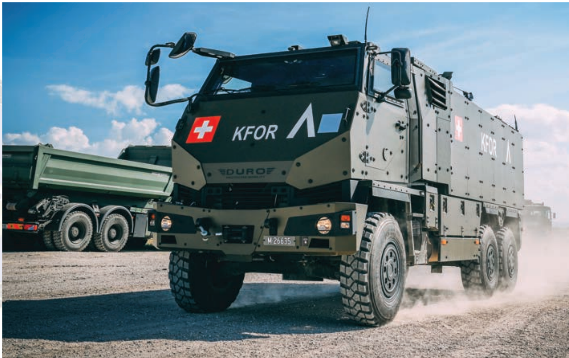
Swiss Freedom of Movement Detachment on the move