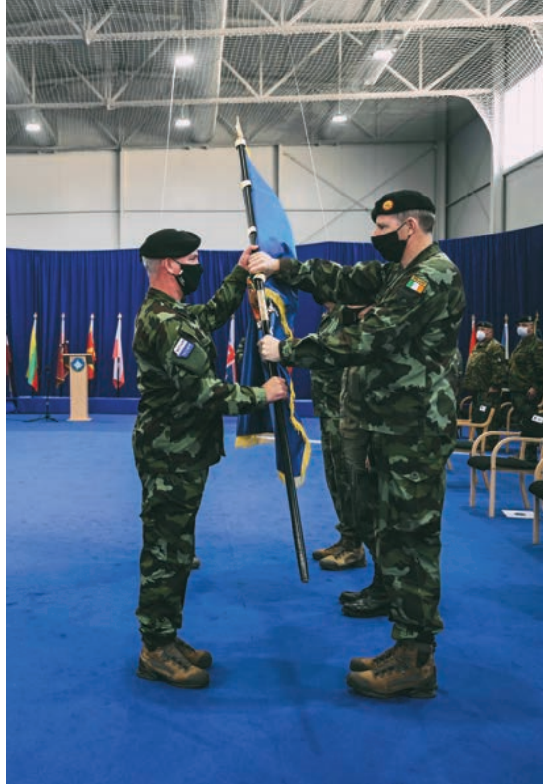
HSG Change of Command Ceremony in KFOR HQ