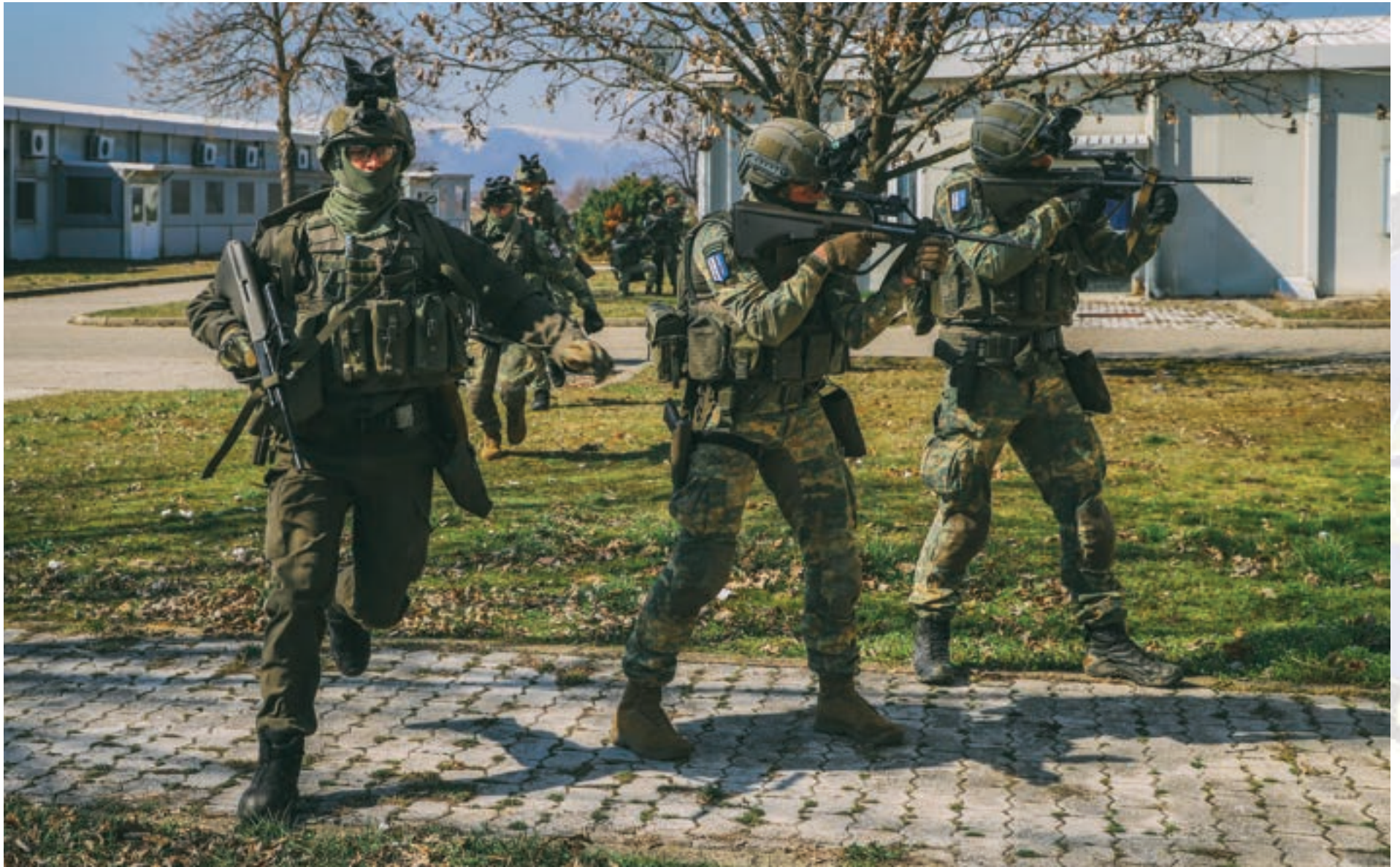
Austrian soldiers during exercise