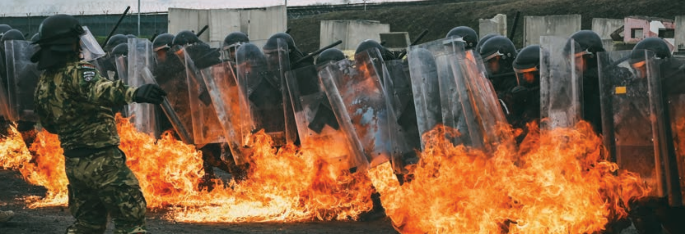
Instructors from KTRBN conduct CRC Training