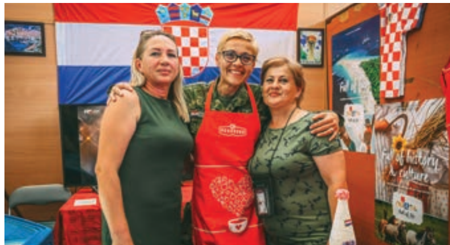
Croatian stand at KFOR International Day in KFOR HQ