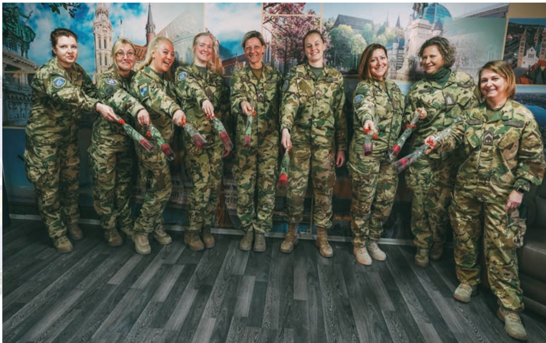
International Women's Day in KFOR HQ