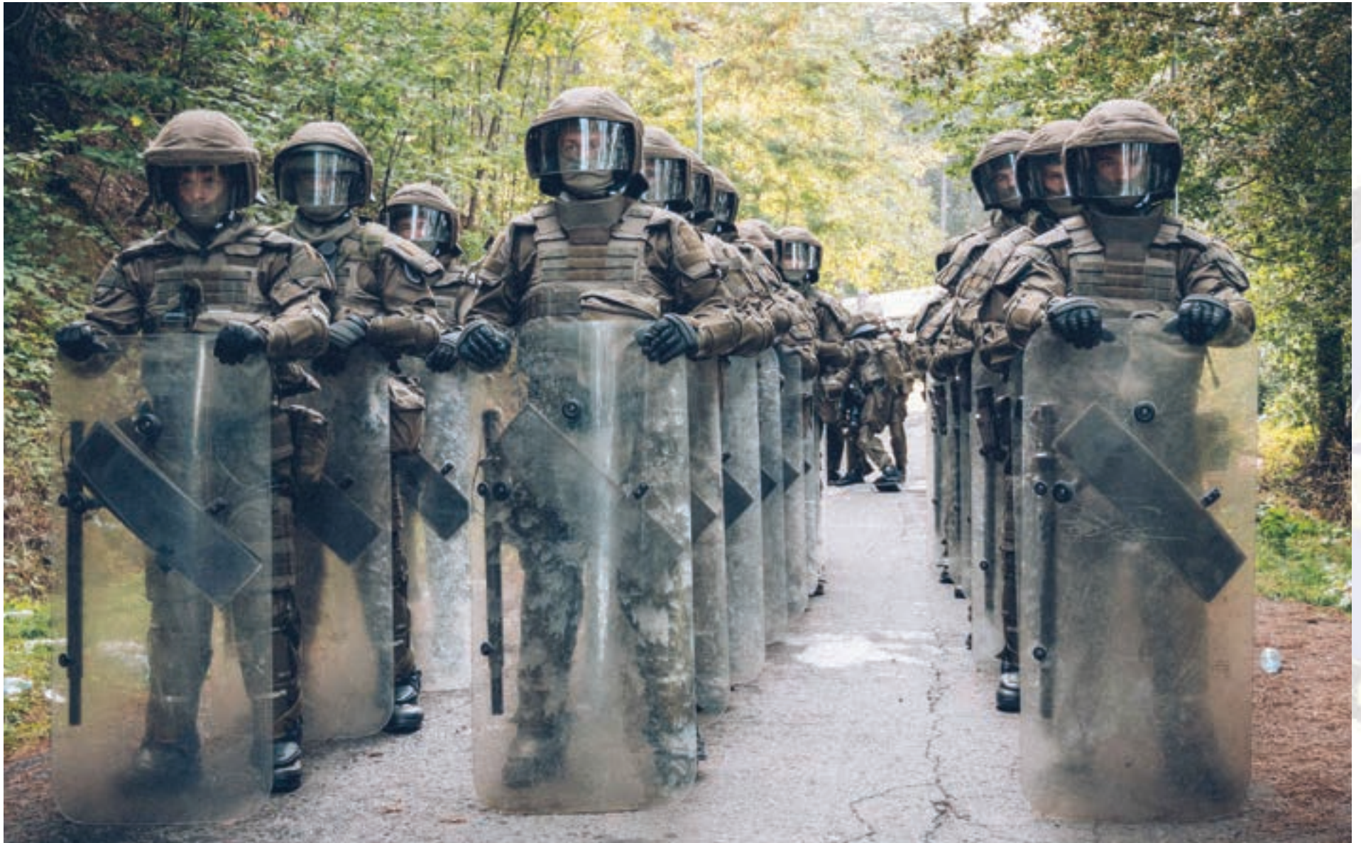
Austrian Contingent during CRC training exercise