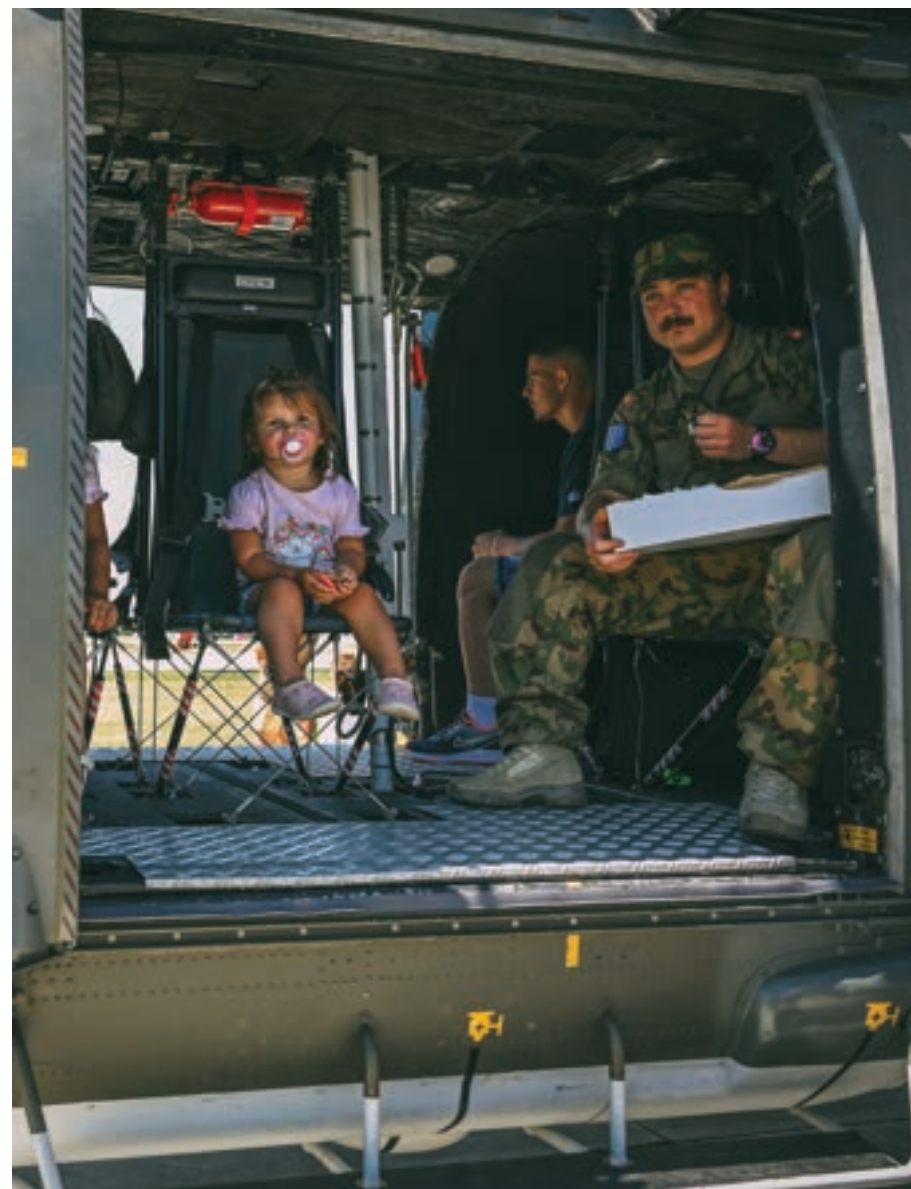
Super Fun in a Swiss Super Puma at KFOR International Day in KFOR HQ