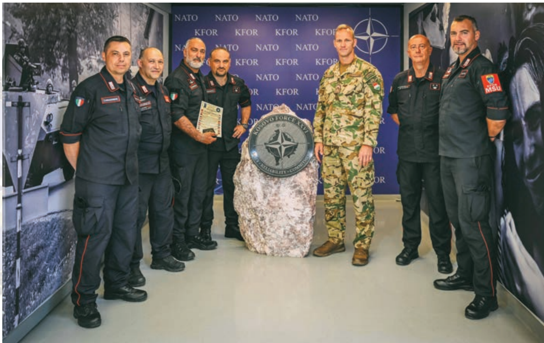
Carabinieri NCO from MSU receives Letter of Appreciation from CSM