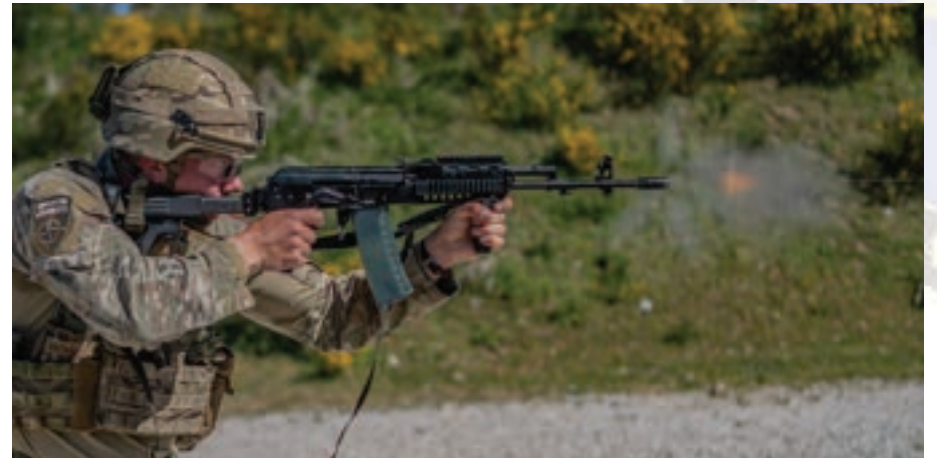
Soldier from US contingent conducts range practices