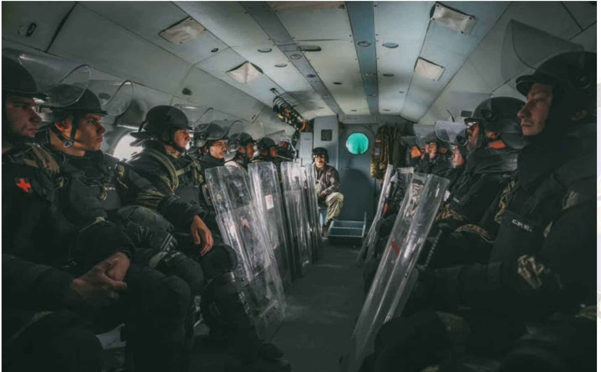
Soldiers from KTRBN conduct Heli drills