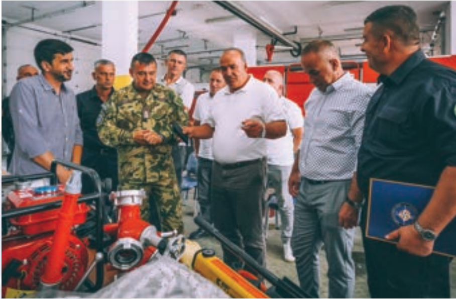
CIMIC donation of Fire Fighting equipment from the Hungarian Contingent