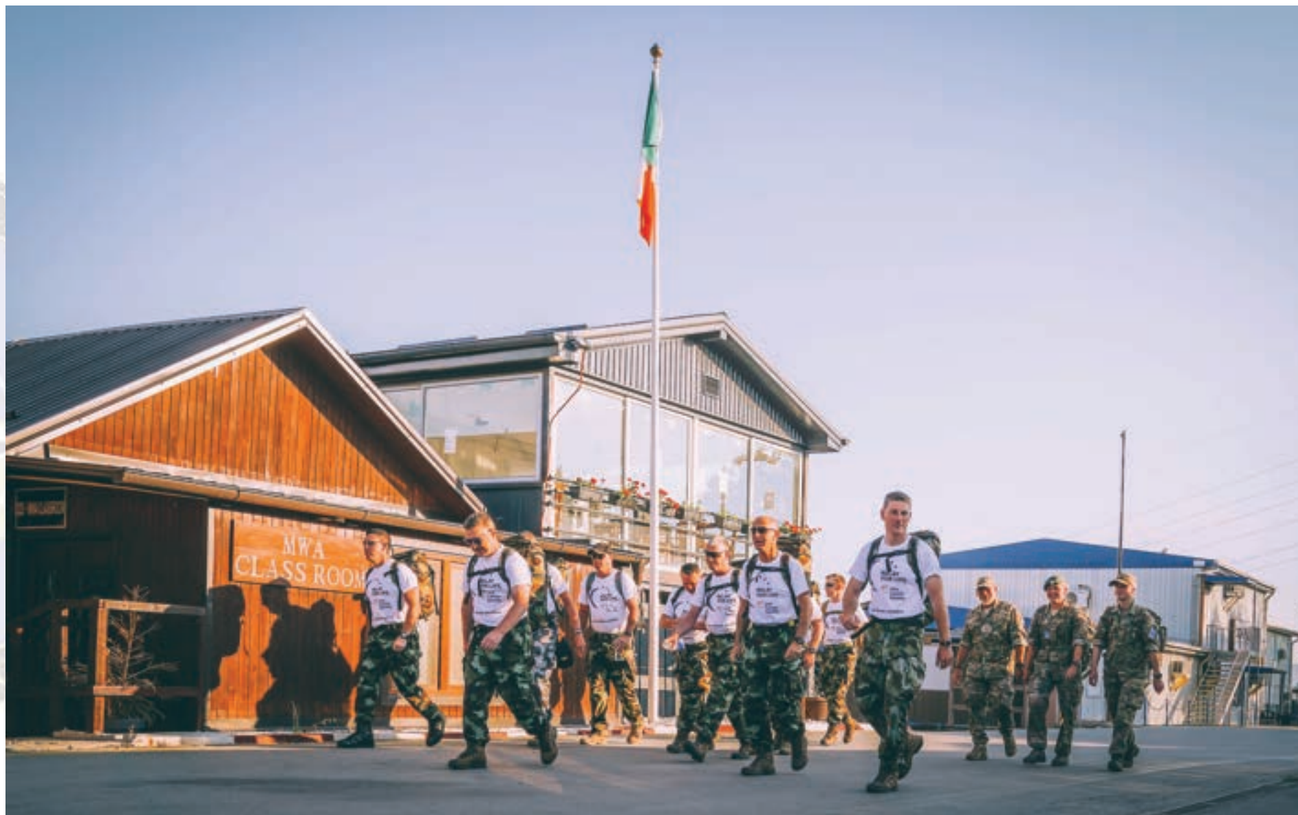
Irish Charity relay march KFOR HQ