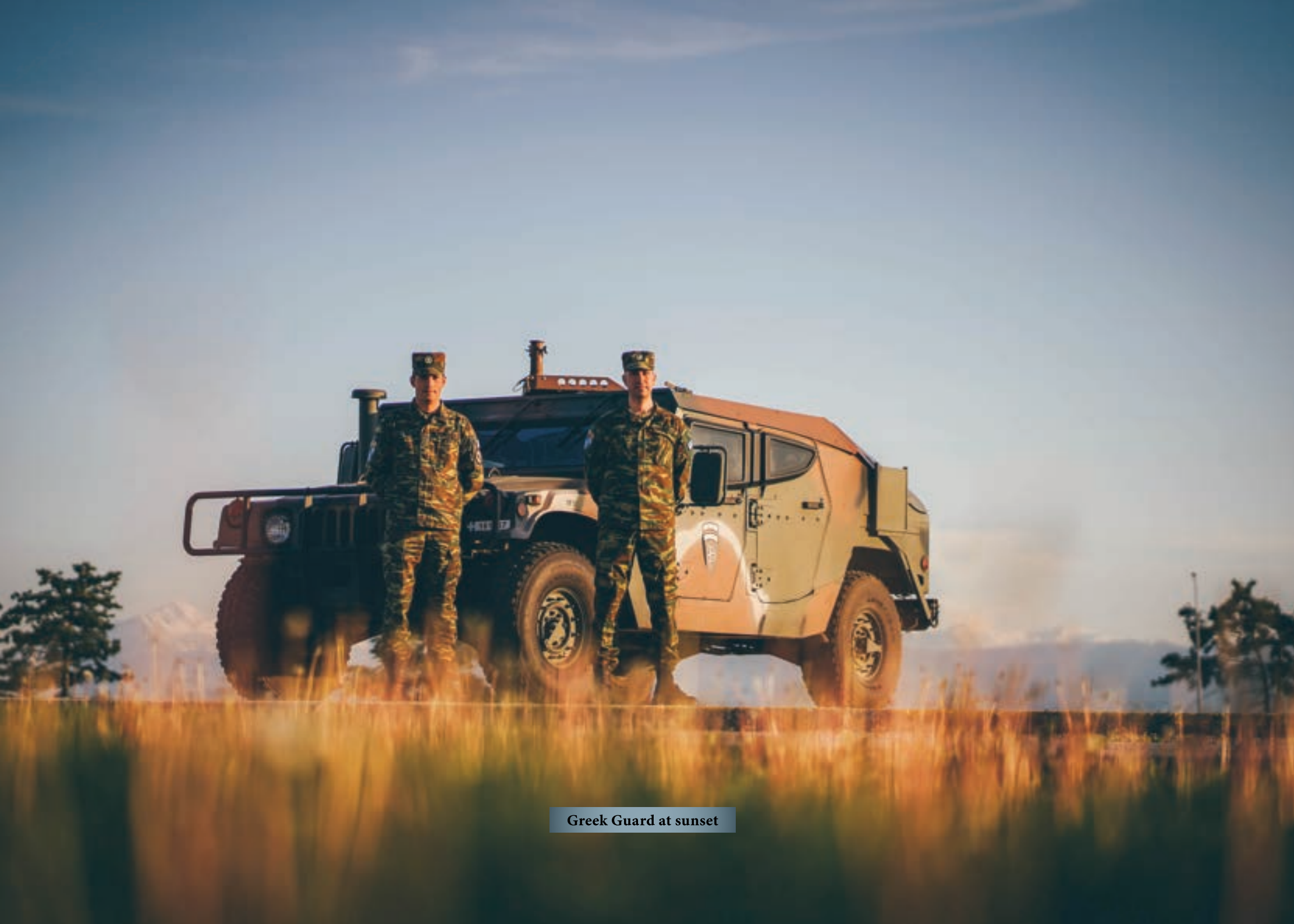
Greek Guard at sunset