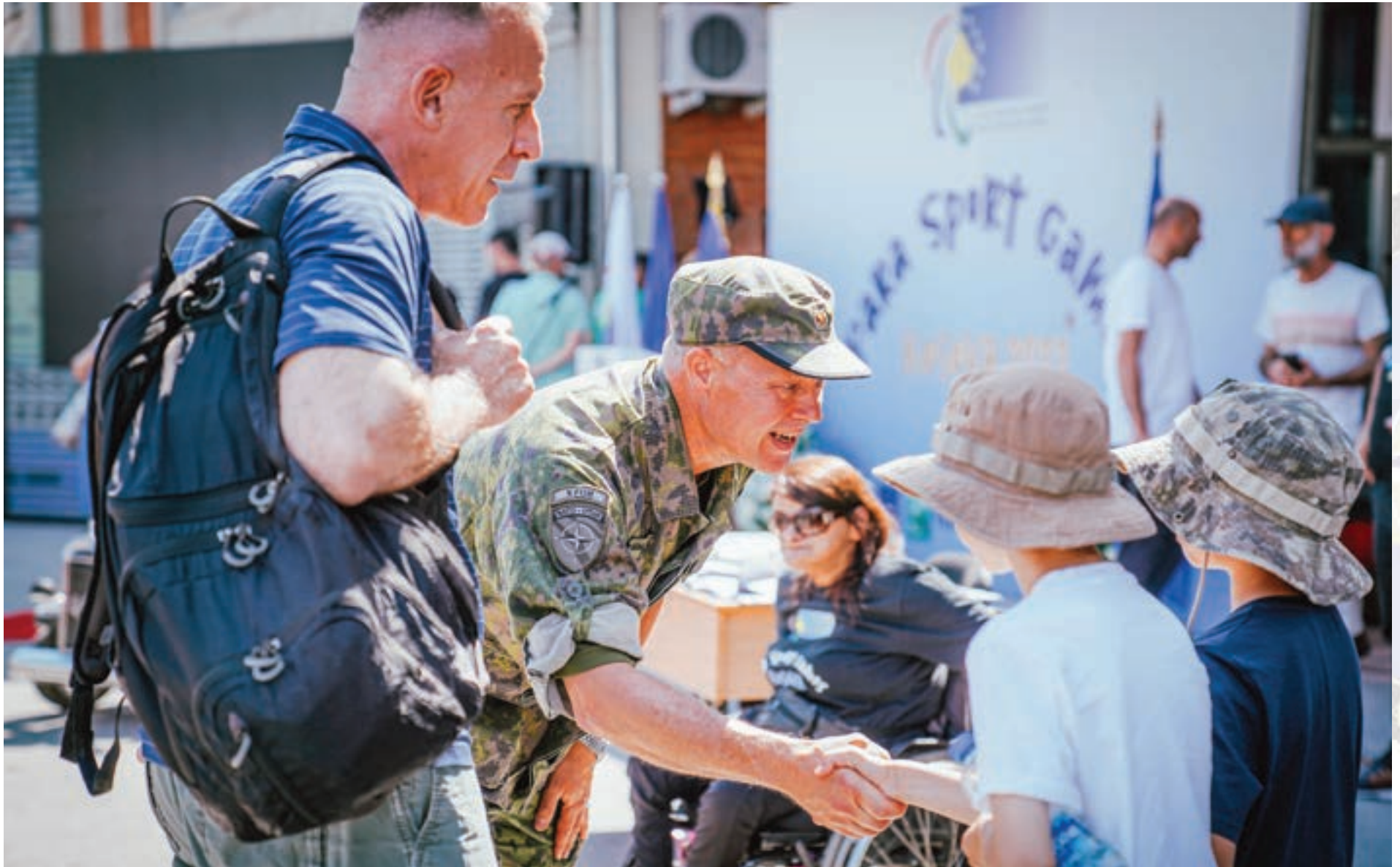
Finnish soldier at Paralympics opening ceremony