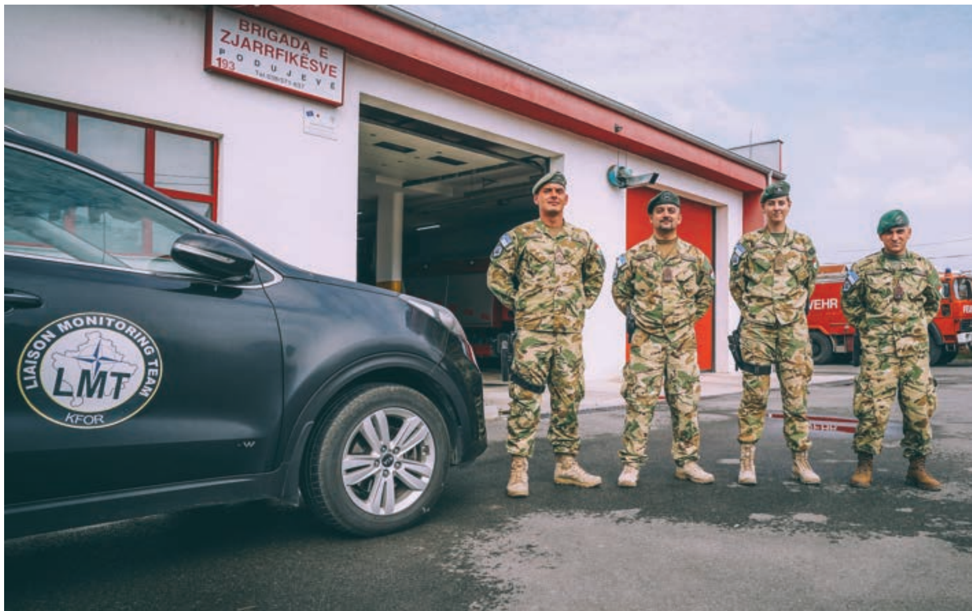
Hungarian Liaison and Monitoring Team