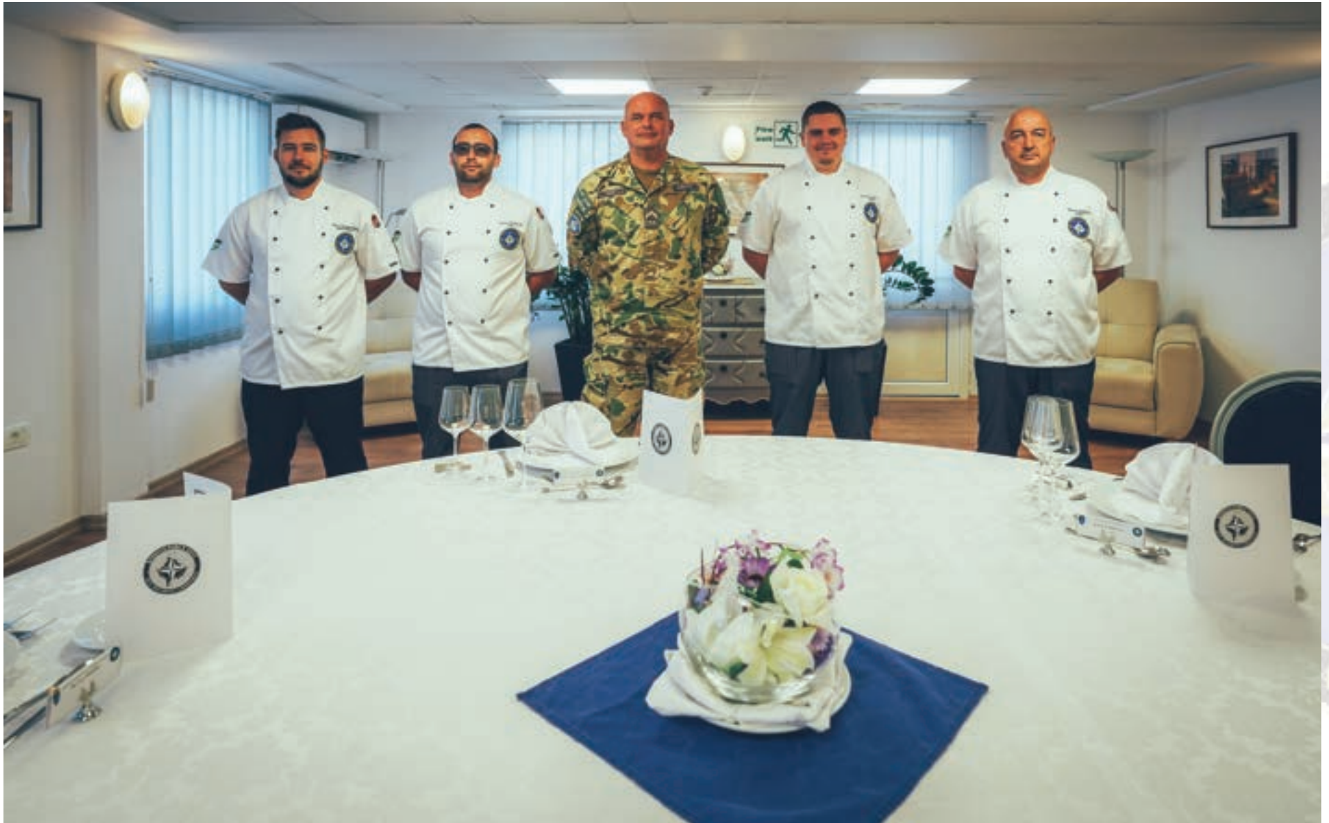
A sample of some of the delicious cuisine created by Hungarian Master Chefs in KFOR HQ