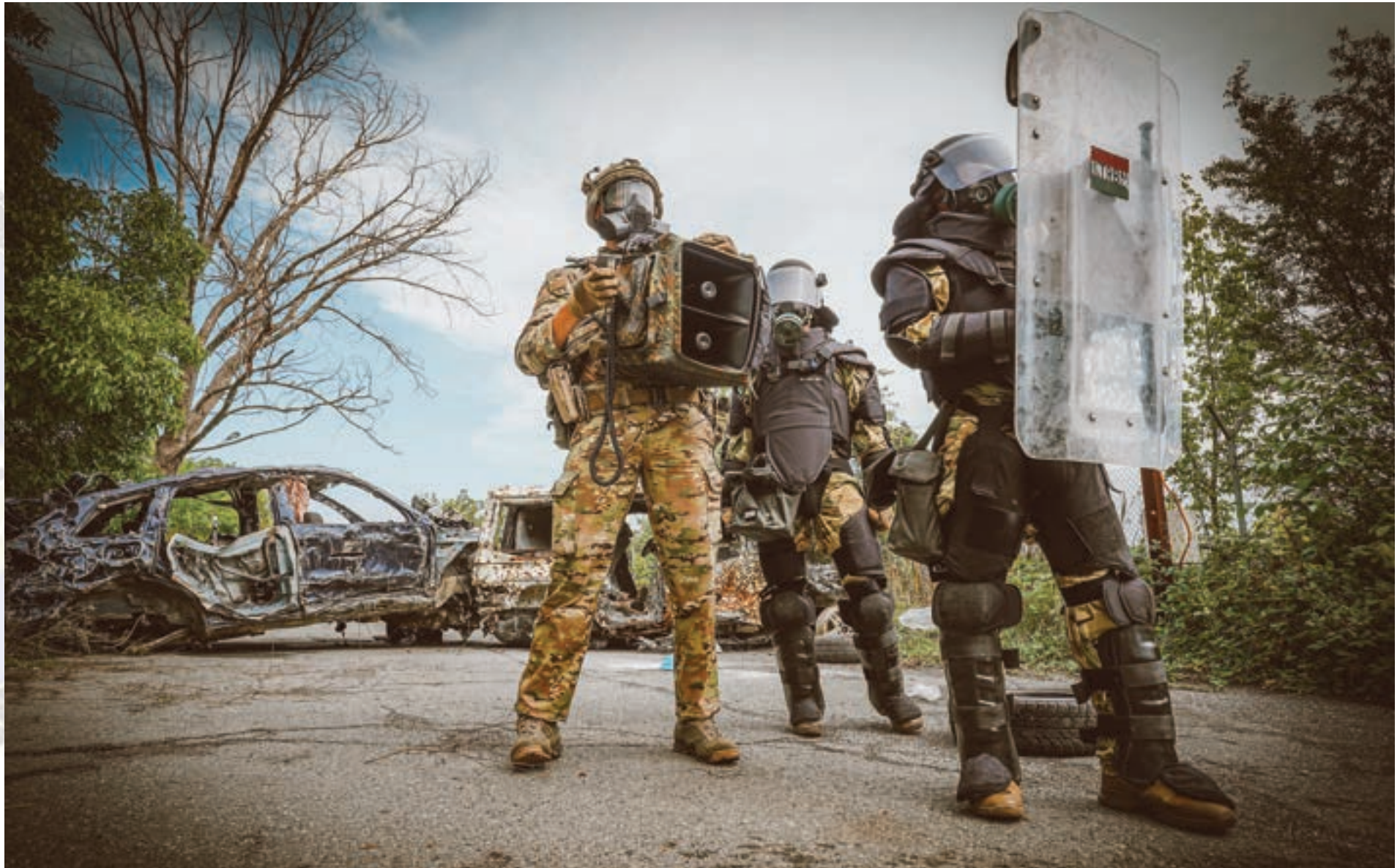
A Danish soldier during exercise Frozen Sabre