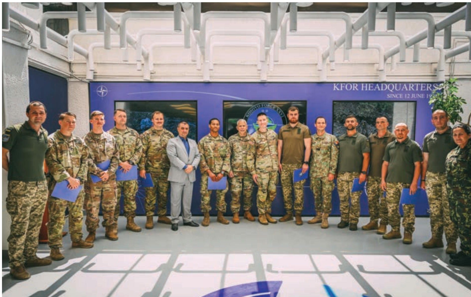
COS presents Certificates of Appreciation to Soldiers from Ukraine and the United States