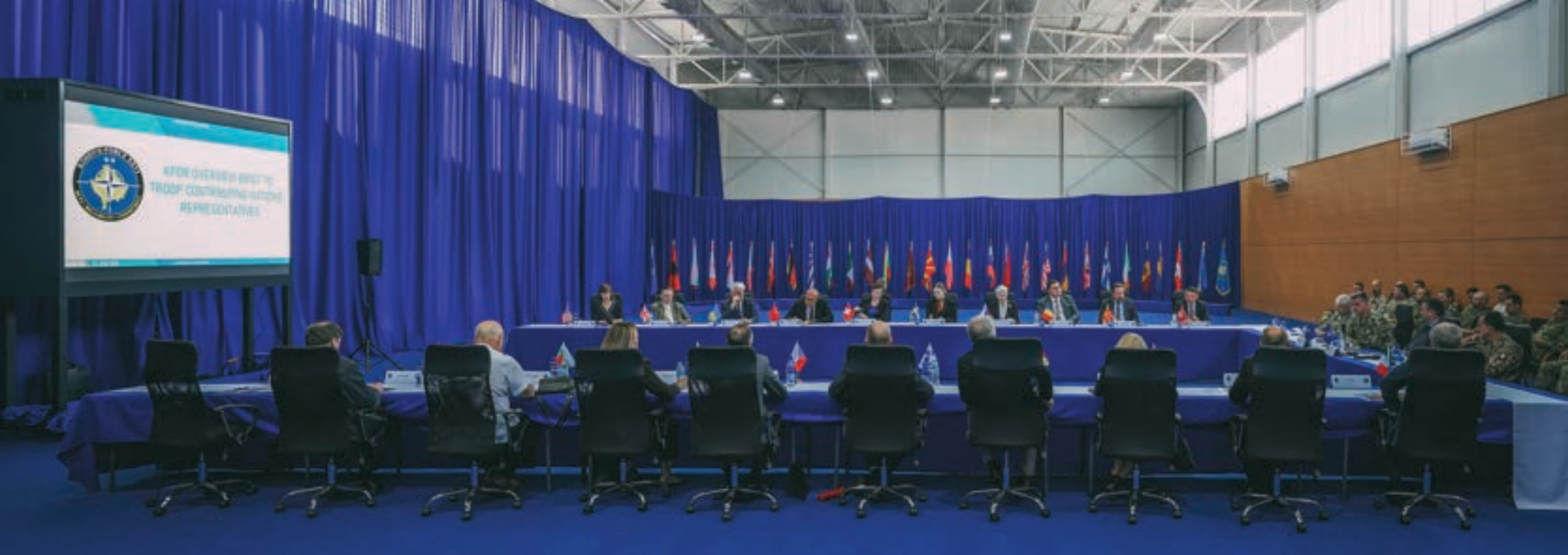
COM KFOR briefs representatives from the Troop Contributing Nations