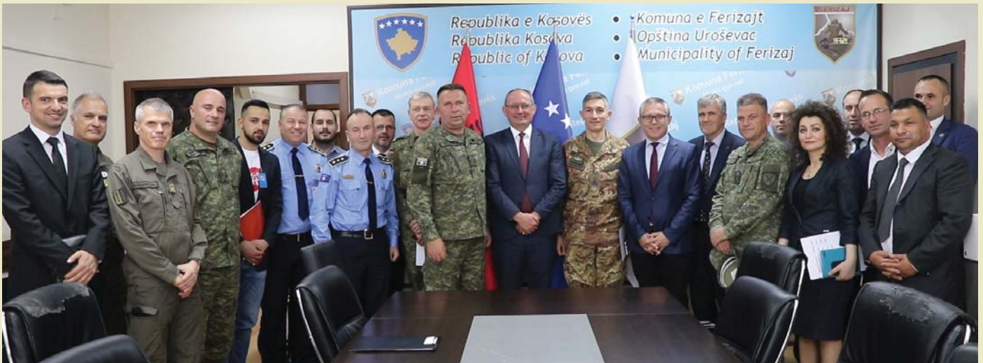
Participants of the Silver Sabre Exercise hosted by the Municipal of Ferizaj/Uroševac and MNBG-E included personnel from KFOR, European Union Rule of Law (EULEX), Emergency Management Agency (EMA), Kosovo Security Council (KSC) Kosovo Security Force (KSF) and Kosovo Police (KP).