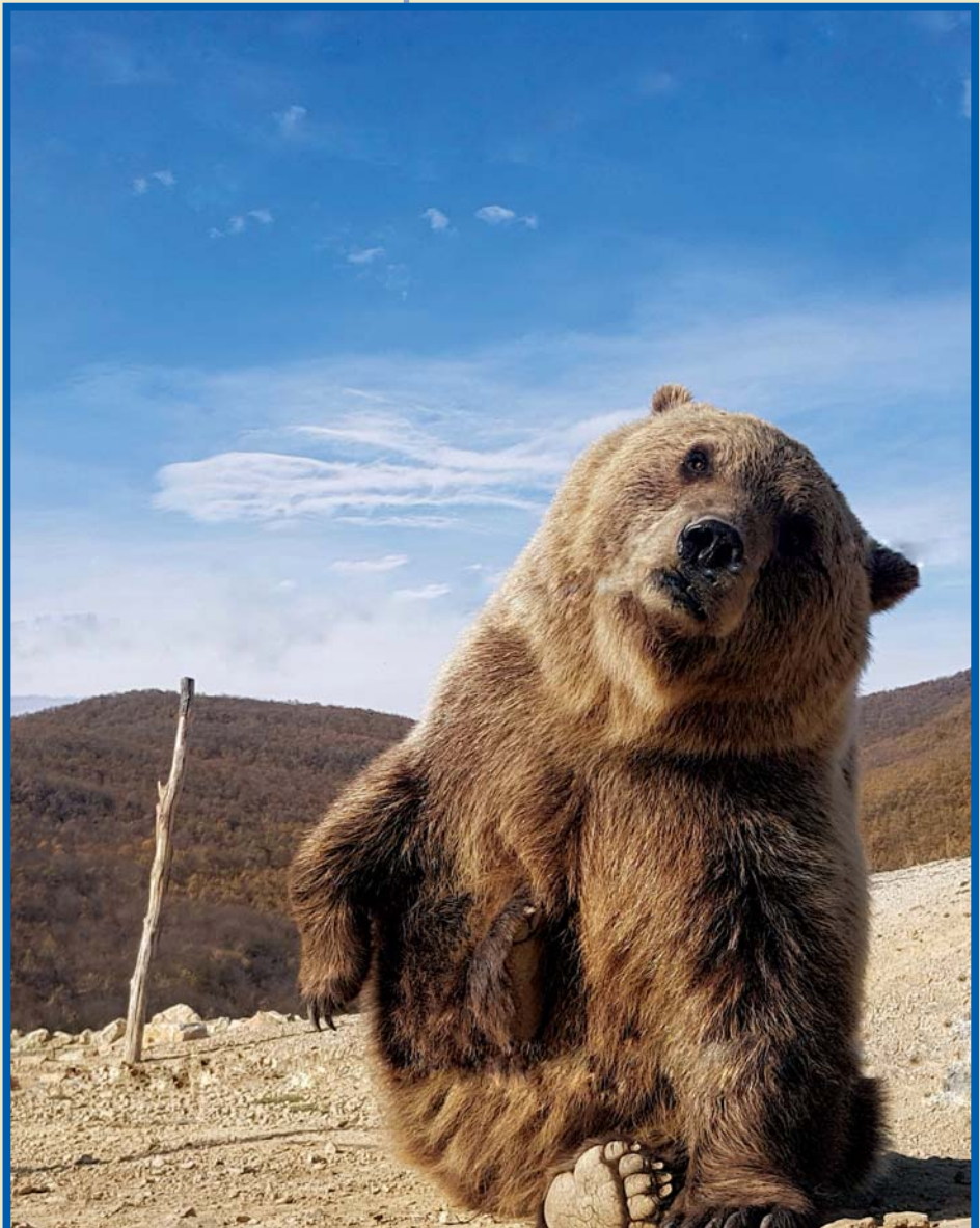
"Bear Sanctuary in Prishtina"