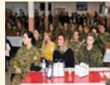
International Women's Day "Equality for Women has Meant Progress for All" page: 8, 9