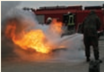
German KFOR Contingent On Fire for Safety page: 10, 11