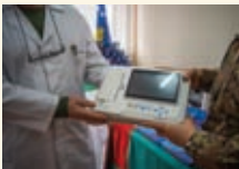
MNBG-W Italian Contingent Equipment to Support Medical Capabilities in Kosovo page: 7