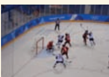
WINTER OLYMPICS The KFOR Connection page: 20