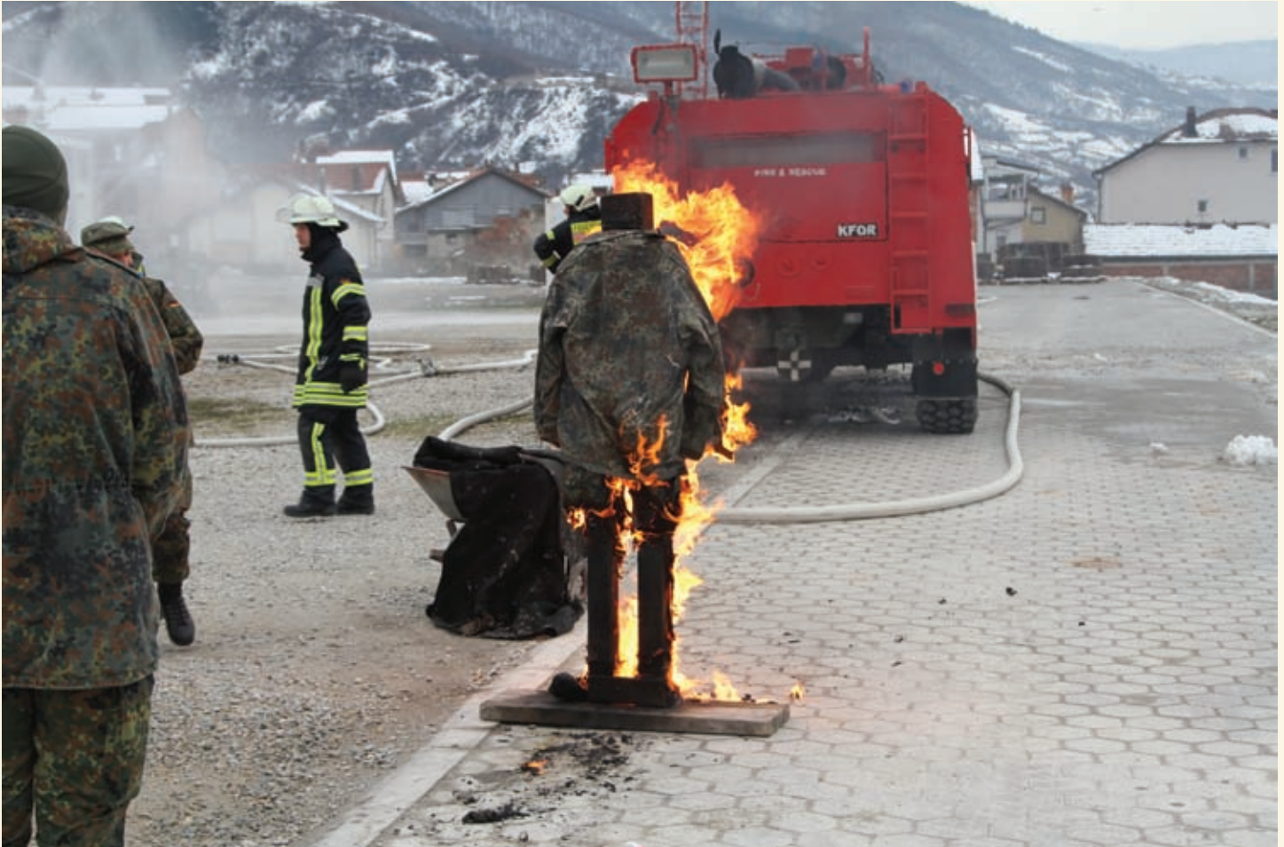
One aspect of the training: how to save a person on fire.

The fire brigade of the German KFOR Contingent practices for emergencies on a regular basis. In mid-February, they conducted a fire safety assistant training. By the time they were done, all trainees were “on fire” for the job.