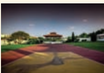
COMMZ(S) KFOR Camp Kodra page: 14 - 16