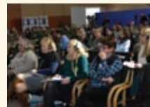
KFOR Gender Perspective Day Women, Peace and Security in Kosovo page: 4-6