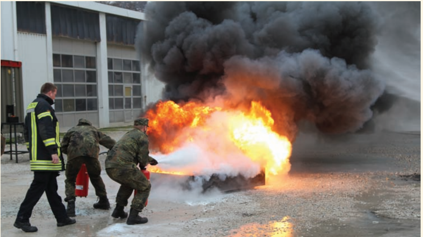
Full on action – the fire safety training was a hot deal.