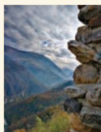
Pictures of the Month Be part of it! March 2018 Winner: OR-6 Roland Sandor page: 22