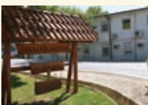
KFOR HSG Our Services During 2017 page: 18