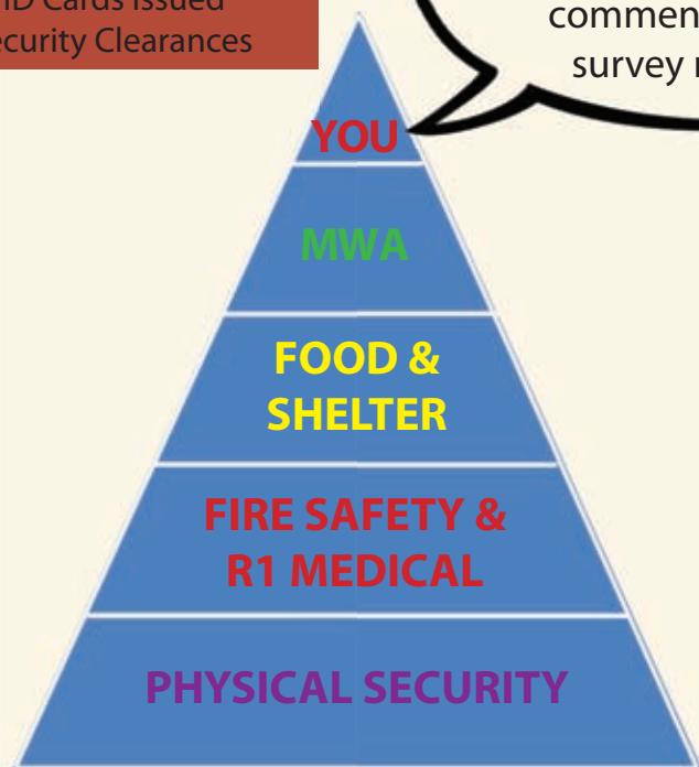
HSG HIERARCHY OF NEEDS

You too play an important part with your comment cards and survey responses