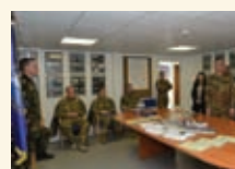
PAO KFOR Chronicle Award Ceremony 2018 page: 17