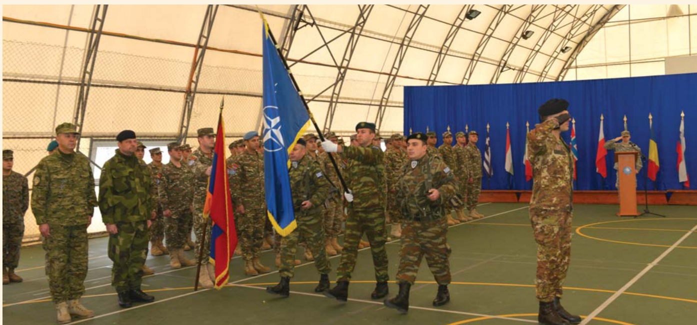
13 th of December 2017, Medal Parade Ceremony at KFOR Film City.