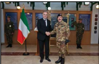
JVB Ministerial Visits to KFOR