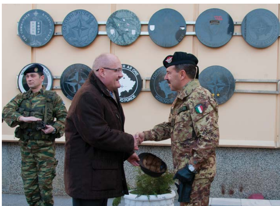
Dr. Csaba Hende receives a Guard of Honour at KFOR HQ

minister greeted the Hungarian Staff Officers and later met with the