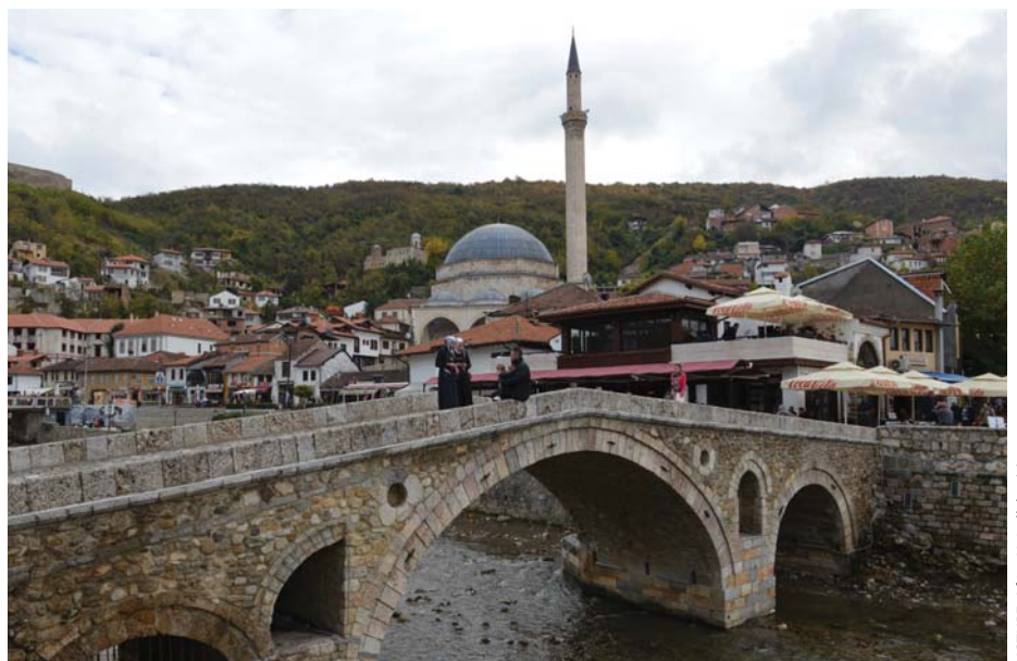
Old Stone Bridge, Prizren

attraction. This once massive medieval citadel will probably prove to be the highlight of your visit. Impressive in itself because of its sheer size but spectacular also because of its prominent