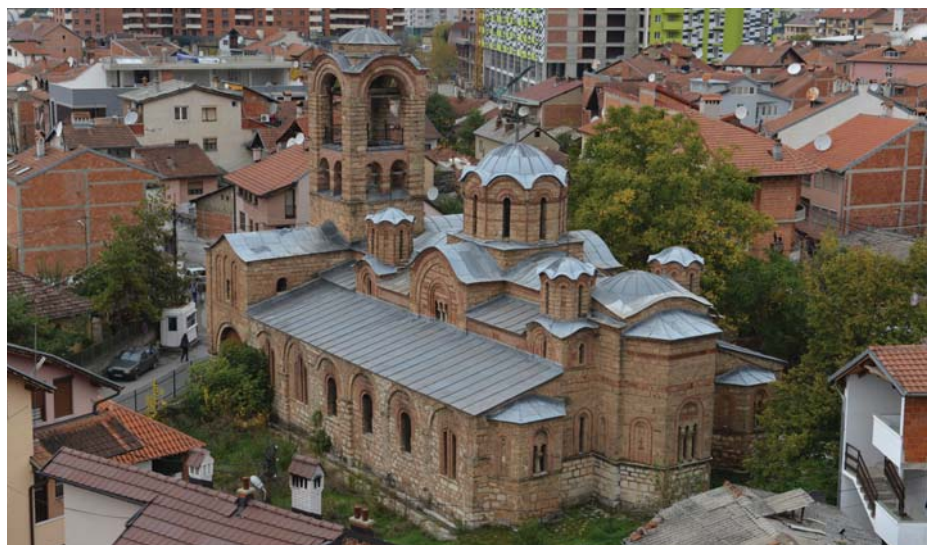
Ljeviška church, which dates from 1307, the Church of the Holy Salvation.

The Gazi Mehmet Pasha Hamam (Turkish bathhouse) is an early Ottoman-era monument in which