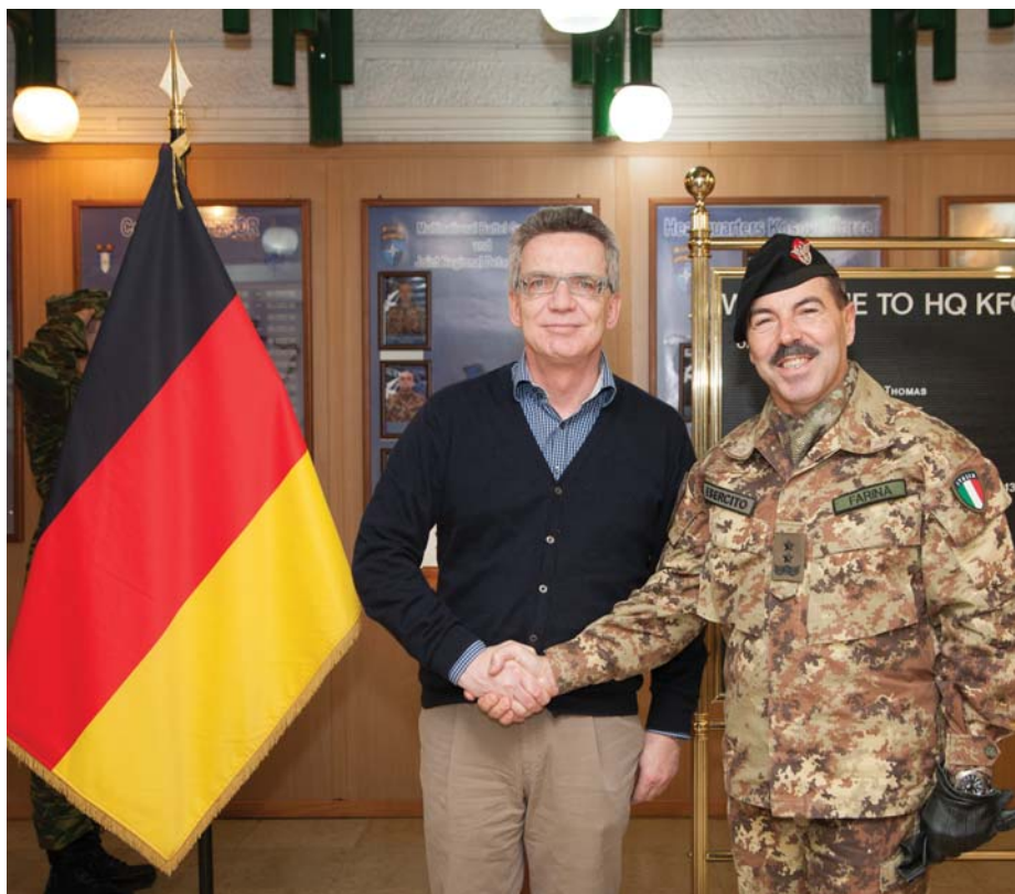
H.E. Thomas De Maiziere is greeted by COM KFOR