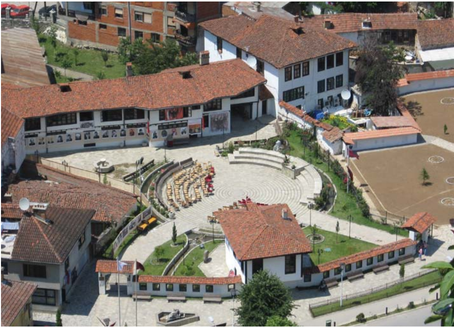
The Prizren League complex dating back to 1878

oriental and local traditions combine. The bath was founded in 1573 and is currently undergoing extensive restoration work. The building is beautifully constructed from rubble stones and lime and it is primarily used for cultural exhibitions and chamber music concerts.