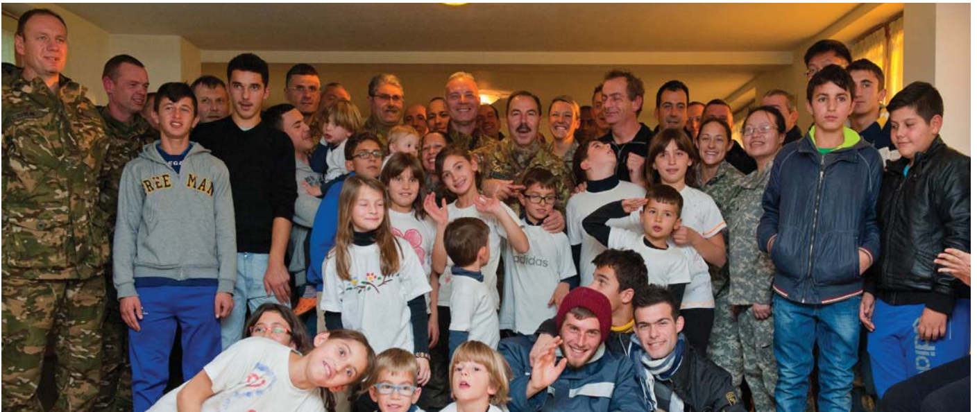
Charitable Donations to Klina Orphanage