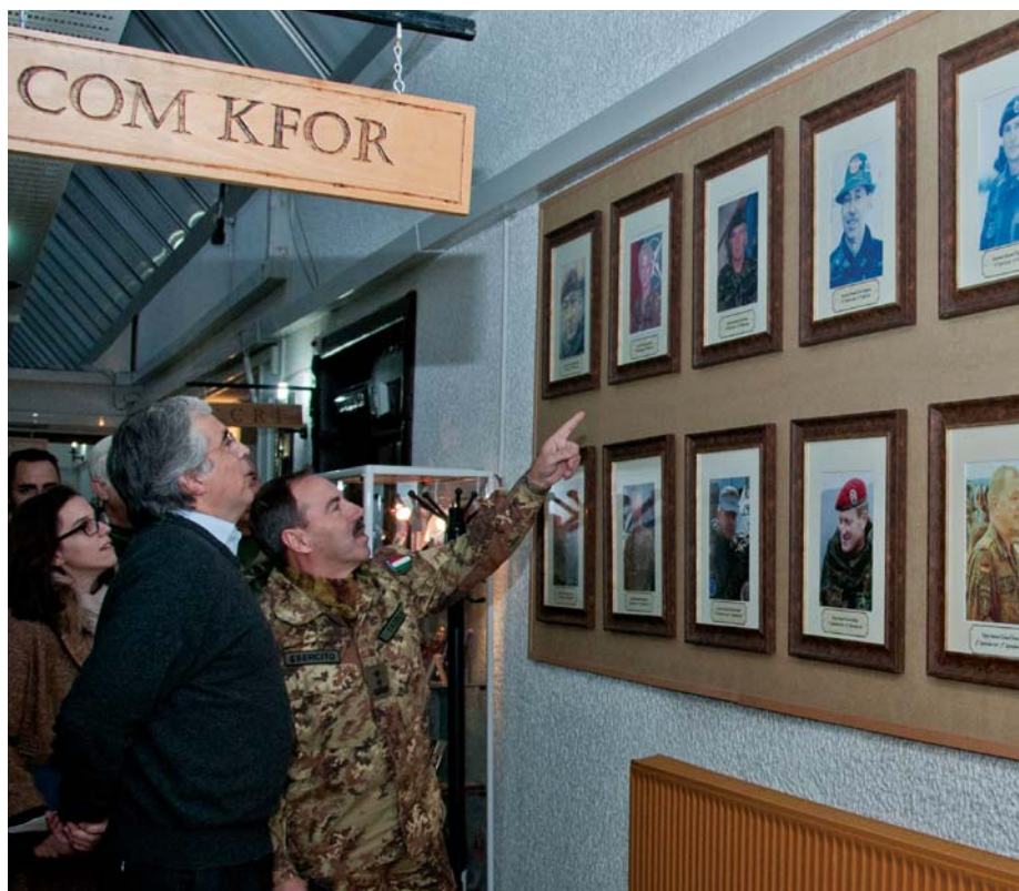
The Portuguese Minister for Defence Mr. José Pedro Aguiar Branco